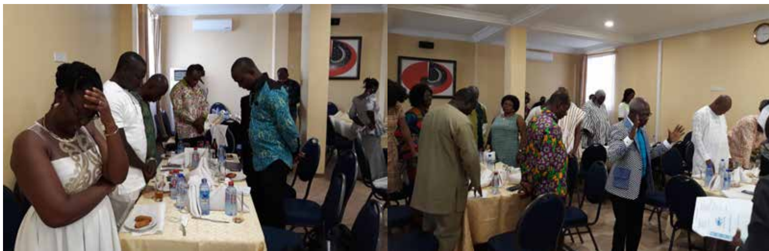
Prayer Time During Appreciation Dinner for Board Members

Under the Village of Hope's Corporate Governance Charter, each subsidiary board is to serve for a period of five years. The current subsidiary boards, having served from February 2013, brought their work to an end this month. To show appreciation for their voluntary and sacrificial work over the past five years, an appreciation dinner was held for all the outgoing board members at the Oceanic Resort at Korle Gonno, a suburb of Accra, on February 4, 2018. B