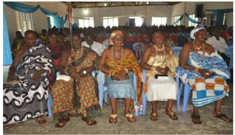
Traditional Authorities of Fetteh at Dedication Ceremony

The building, though completed, is now empty. Now comes the equally challenging part of equipping it for use. Without the necessary equipment and furniture, it cannot be put to use. The hospital staff are excited and anxious to get to work to save the lives of children but cannot do so until the facility is fully equipped. It has taken years of sacrifices to come this far in completing the construction of the pediatric building. Please join us to make the building functional. With all of us helping a little, we can equip and furnish the building and put it to use within a short time. Please see Pages 4 & 5 for a list of equipment, furniture and items needed to enable us put the building to use. This facility will be only the second pediatric facility with a Neonatal Intensive Care Unit (NICU) in the entire Central Region of Ghana with a population of about three million people. Just imagine how many children's lives can be saved and how much good can be accomplished to the praise and glory of God. 📄