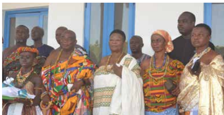
Chief of Fetteh (6th from right), Queen Mother of Fetteh (5th from right) & Other Guests in front of Pediatric Building Shortly before Dedication to the Service and Glory of God