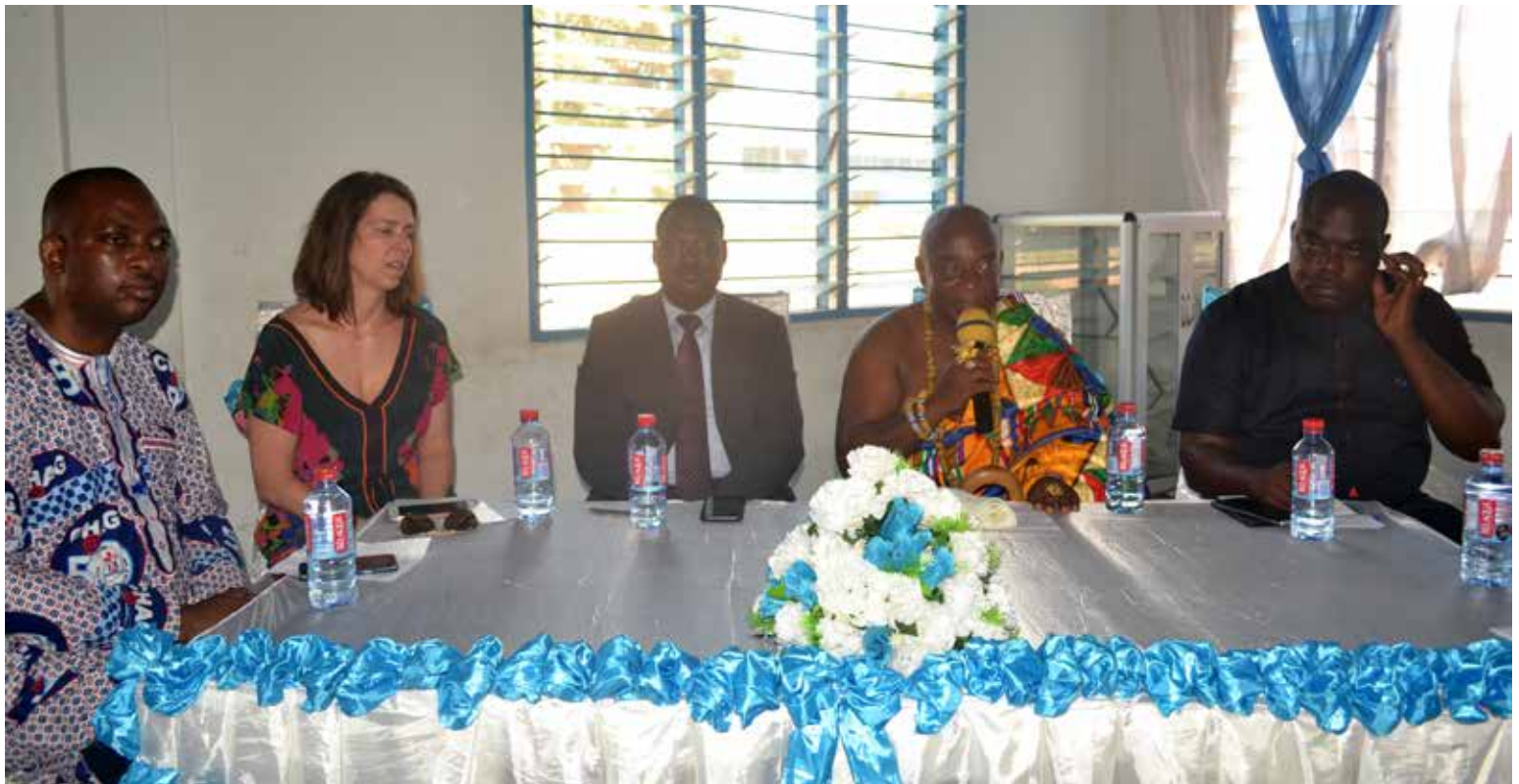
Dignitaries who attended the dedication ceremony included (from left to right): the Executive Director of the Christian Health Association of Ghana, the President of Dreams for Orphans, the Central Regional Director of Health Services, the Chief of Fetteh, and the Member of Parliament for Gomoa East Constituency.