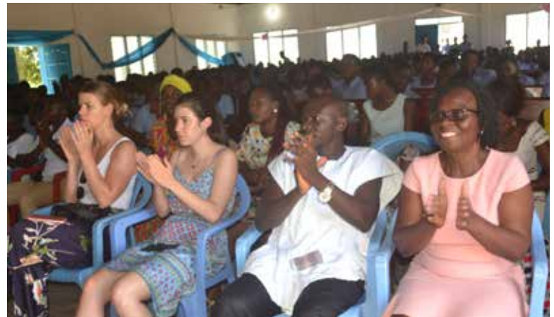
Audience: Smith Hall was filled to capacity. Seated in the front row were two guests who were part of the team from Dreams for Orphans; the medical director and the matron (head nurse) of the hospital.