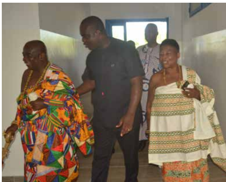
Chief of Fetteh, Member of Parliament for Fetteh Area (Gomoa East Constituency), Queen Mother of Fetteh & Executive Director of Christian Health Association of Ghana Inspect the Building after its Dedication