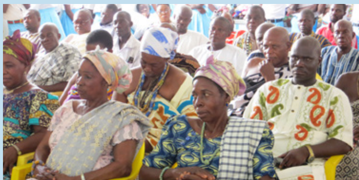
Cross Section of Attendees at Presentation of Donation

Present at the event were staff of Hope Christian Hospital and Village of Hope; the chief of Gomoa-Fetteh and his entourage; and representatives of Dreams for Orphans. The remaining needs of the pediatric unit are listed here. Kindly support us to fully equip this unit for the children. @