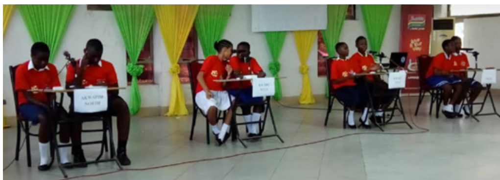
Competition in Progress