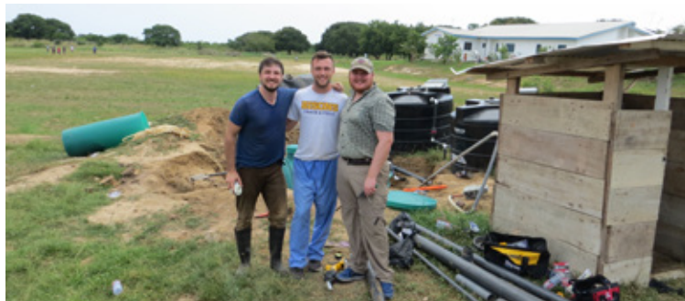
Engineers from Lipscomb University visited to continue work on the prototype sanitation and filtration system on the Fetteh campus to help treat liquid waste water.