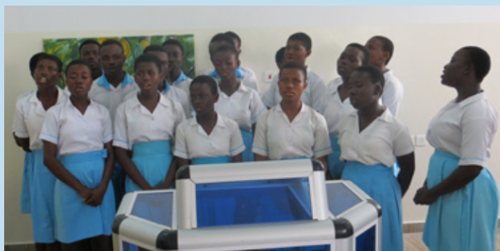
Children of Village of Hope Sing During DFO Presentation to Hope Christian Hospital