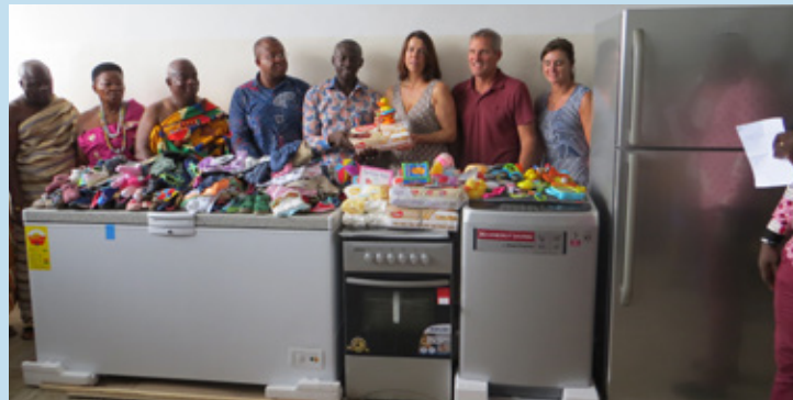
Representatives of DFO, VOH, & Fetteh Royal Family with Donated Items