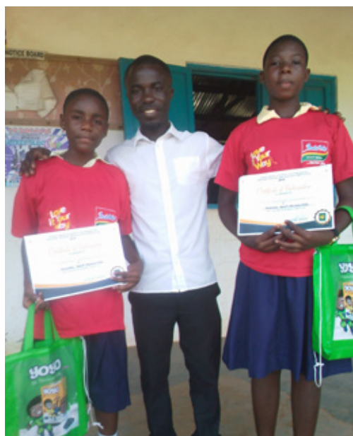
Clockwise from Top: Representatives of Kwahu East District