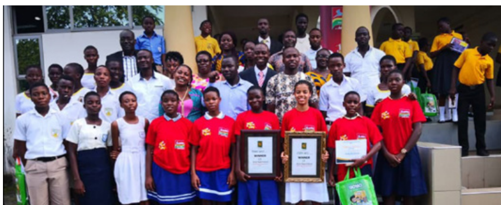
Group Photo of Competitors & Other Event Participants

On October 19, the Ghana Library Authority organized a regional reading and spelling competition among nine districts (counties) in the Eastern Region of Ghana. Among these districts is the Kwahu East District where Church of Christ School is located. Prior to the regional competition, schools in each district had held district competitions and both