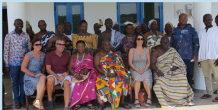
Group Photo of Representatives of DFO, VOH, & Fetteh Royal Family

This November, Dreams for Orphans donated equipment and other items to Village of Hope for the pediatric unit of Hope Christian Hospital. The items included a double-door refrigerator, a