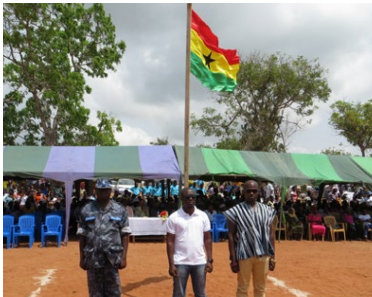
Local Government Representatives Stand for March-past