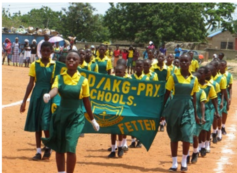
Students of Church of Christ School, Fetteh