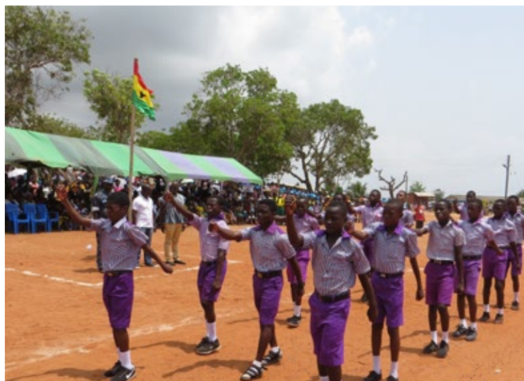
Students of Rock of Ages Institute, Fetteh