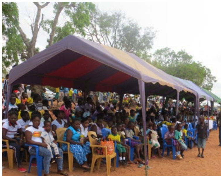
Gomoa Fetteh Community Attends March 6 Activities