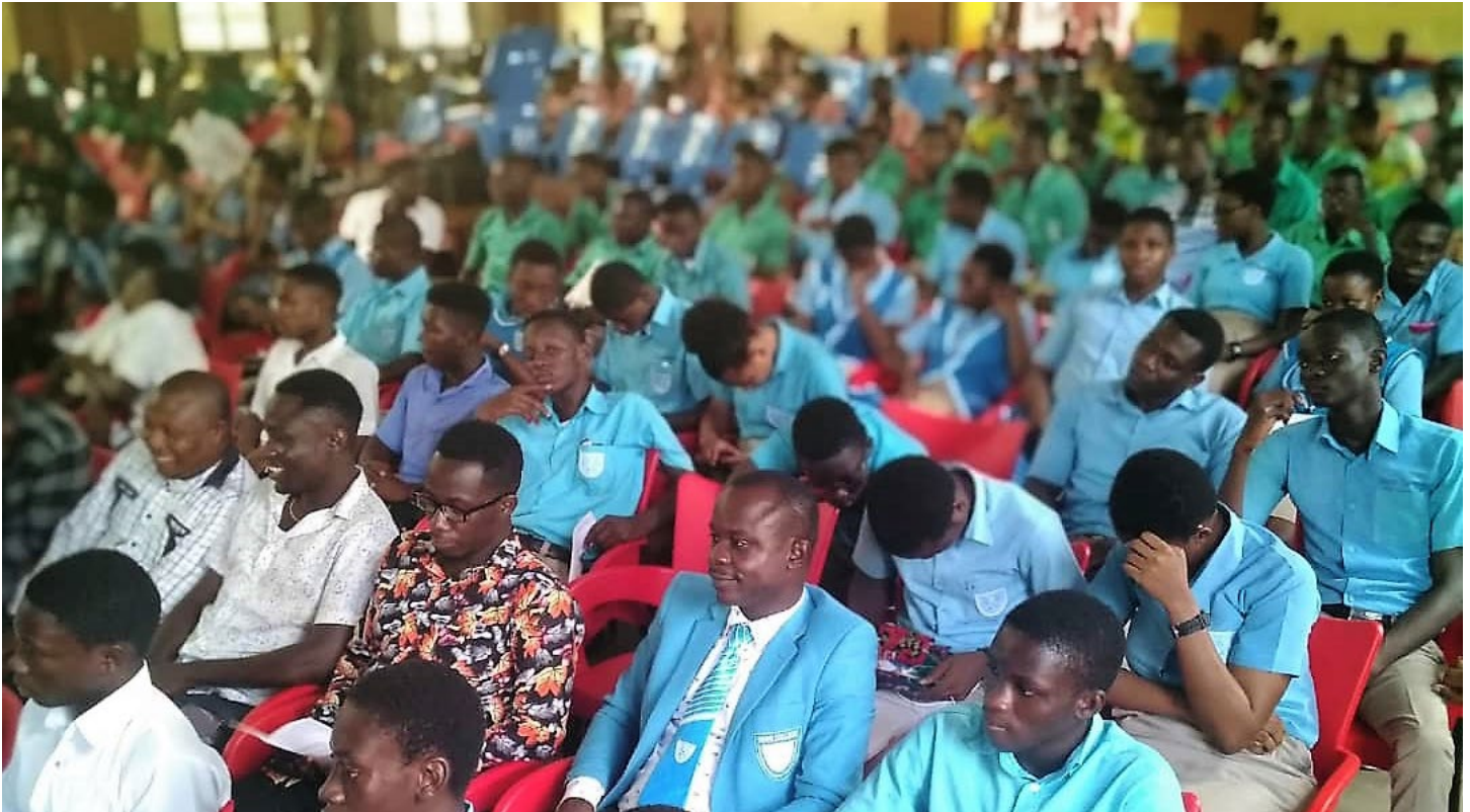
Quiz Competition Audience including Staff & Students of Hope College

H ope College participated in the National Science and Math Quiz (NSMQ) competition for the first time in March 2019. The competition which is aimed at promoting the teaching and learning of science and mathematics in the country has been held among high schools in Ghana since 1993. It was solely the preserve of public schools until last year when a private high school was permitted to participate. Hope College is the second private high school in Ghana to participate in the competition. The NSMQ is held at the regional (state) level and the national level. Hope College placed second in their competition but unfortunately will not be able to participate at the national level because only schools that place first in their competition at the regional level qualify to enter the competition at the national level. With the experience gained at this year's competition, we are hopeful that our students will do better next year and qualify for the national level of competition. 📄