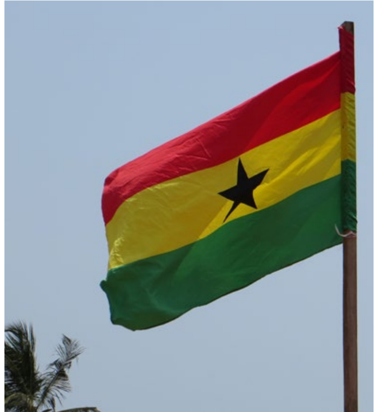
Right: Ghana's National Flag Below: Hope Christian Academy Students in Parade

At Fetteh, hundreds of children from the schools in the community held a parade and march-past which was witnessed by virtually the entire population of the village. In attendance were the chief and elders of Fetteh. Here are some pictures from the celebration at Fetteh. 📷