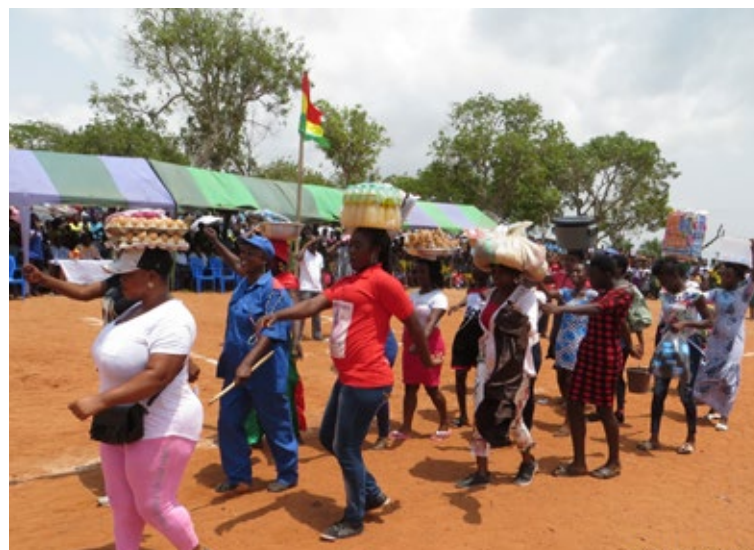
Market Traders of Fetteh Community