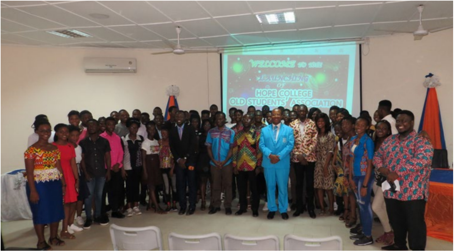
Alumni of Hope College with Invited Guests, Headmaster, Patron, and Chairperson for Inauguration of Alumni Association

On Saturday, February 23, 2019, alumni of Hope College formally inaugurated their association at the Kwame Nkrumah University of Science and Technology (KNUST) in Kumasi, Ghana's second largest city. Hope College alumni from other universities attended the program to share their solidarity with the KNUST students. Interestingly, students from various universities in Accra hired a bus and travelled for four hours (one way) to witness the occasion.