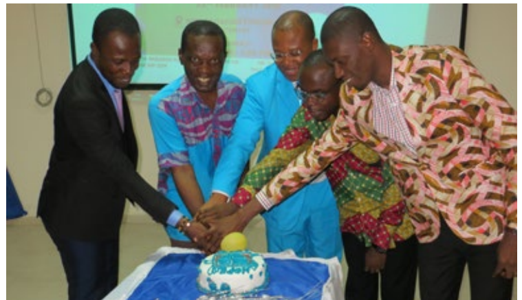
Invited Guests & Patron Cut Association Launch Cake

During the occasion, the executive members of the association were inducted into office. With this event, it is hoped that alumni association chapters will be formed in various tertiary institutions and cities in Ghana in the near future. The pioneering class of Hope College graduated from the school in May 2015. To date, a total of 362 students have graduated from Hope College. 1