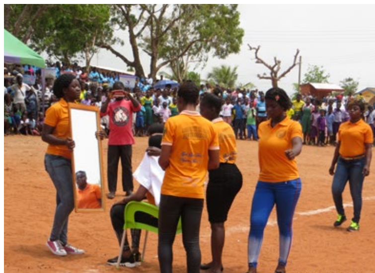
Beauticians of Fetteh Community