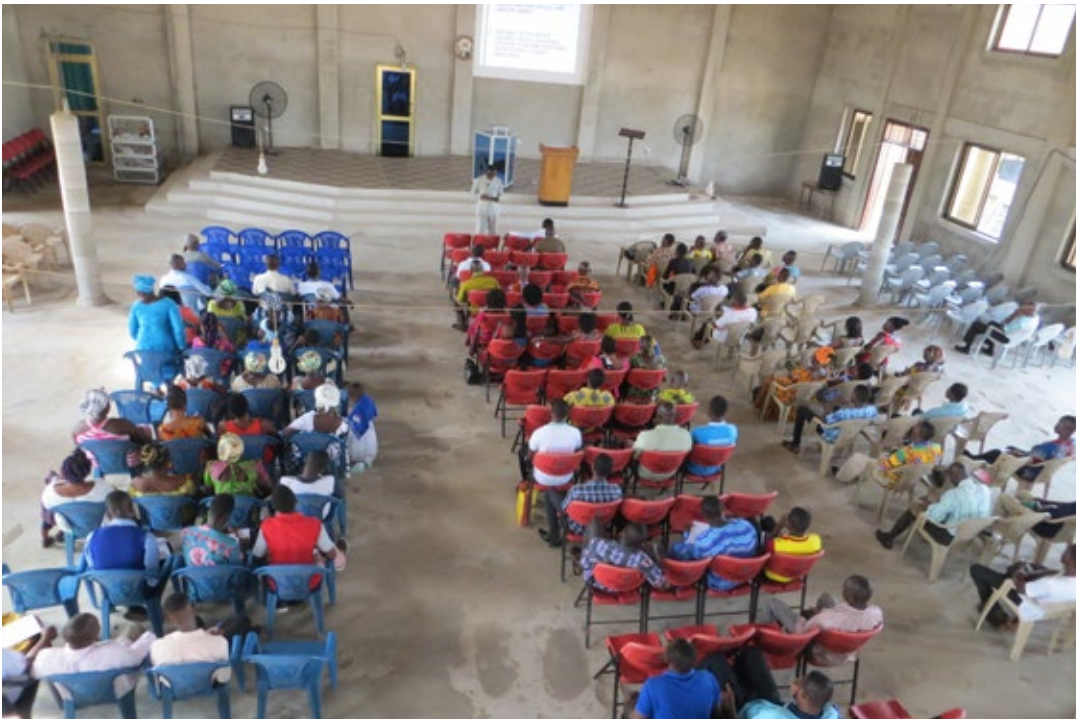
Meeting of KAGE Area Leaders

Every other month, leaders from the 35 churches of Christ in the Kasoa, Awutu, Gomoa and Efutu (KAGE) area of the Central Region of Ghana meet for Christian fellowship. These meetings have been a source of unity and cooperation among the congregations. Sometimes, the meetings focus on prayers. At other times, the focus is on Bible studies or planning for the growth of the churches. On a few occasions, the meetings focus on solving problems that have arisen in a congregation for which the leaders seek the help and support of other congregations to solve. Sometimes the meeting does a little bit of all, that is, prayers, Bible studies, planning and problem solving.