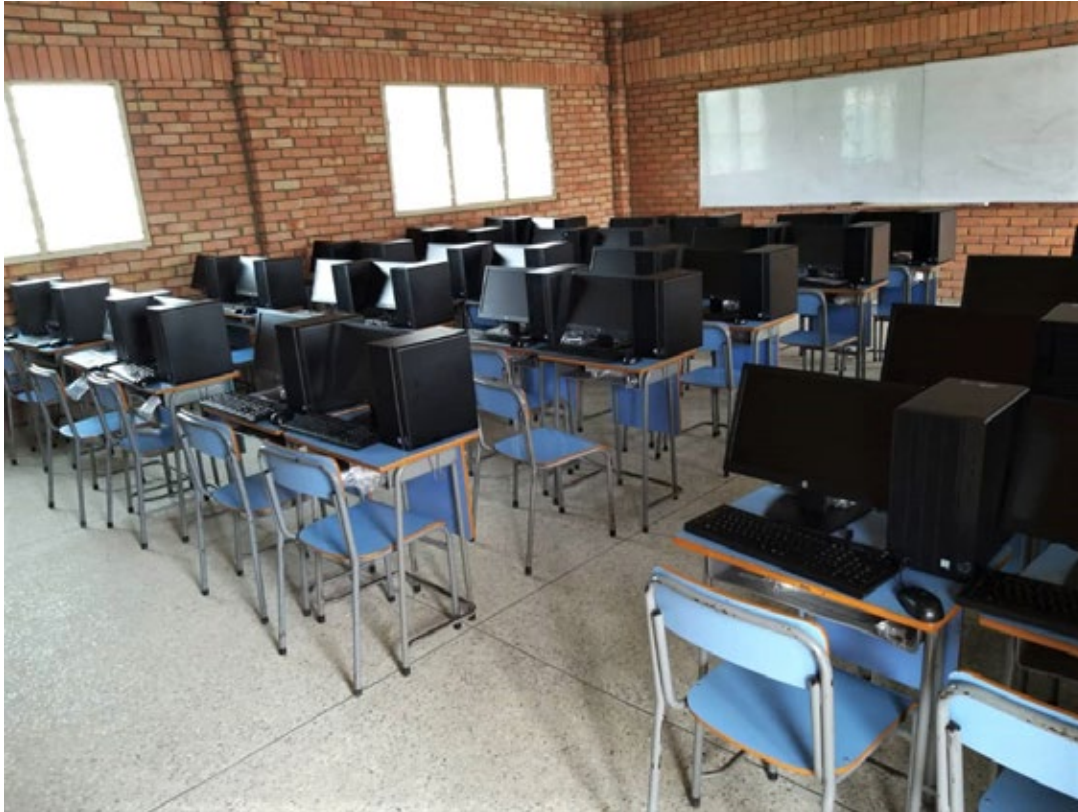
40 New Desktop Computers for Hope College

Since the beginning of Hope College in 2012, classes have been taught in Information and Communications Technology (ICT) and students have been taught about computers without computers for demonstration purposes and for students to actually practice. This has been very difficult on teachers and students alike. We so much wanted to end this unfortunate situation but we did not have the funds to buy computers for the school. As such, we came to you with an appeal to help us buy computers for Hope College.