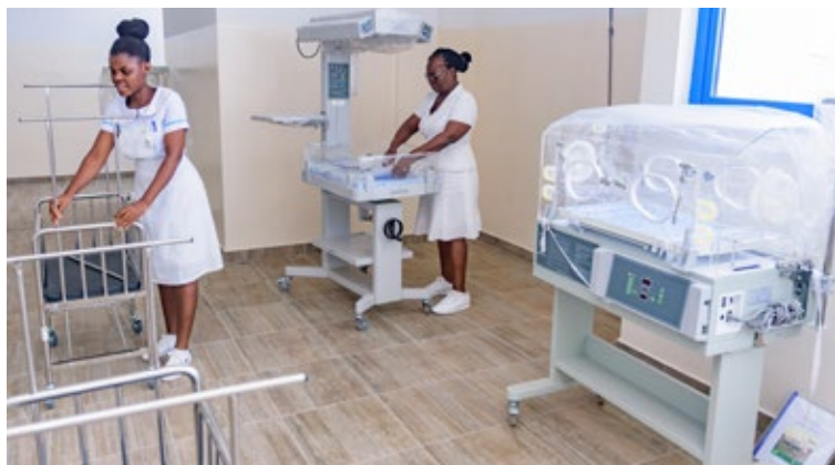
Hospital Matron & Nurses Set up Much Needed Cots & Incubators in Neonatal Intensive Care Unit

Through your help, the Neonatal Intensive Care Unit (NICU) has been equipped to the point where it is functional. The Barnett Houses have been furnished and are now functional. Some beds have been purchased to expand in-patient care. We do not have all the equipment and furniture we need but at least, we can put the facilities we have to use and we are able to help more sick people than we could previously do. @