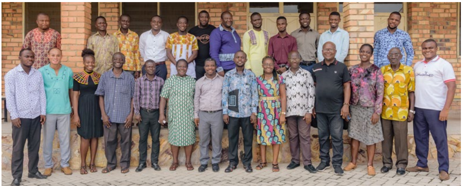
Teaching Staff of Hope College