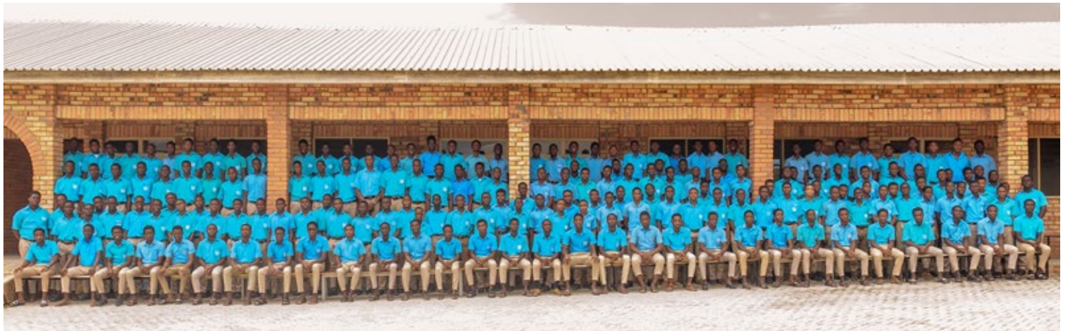
Male Students of Hope College