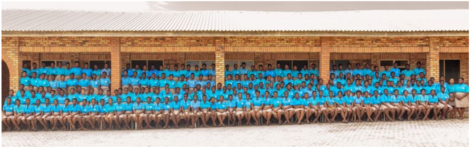
Female Students of Hope College

Here are the beneficiaries of your gift of computers to Hope College – the current students and their teachers – and many more who will be enrolling in the future. 📺