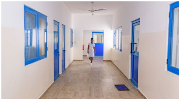
Inside the Halls of the Pediatric Unit