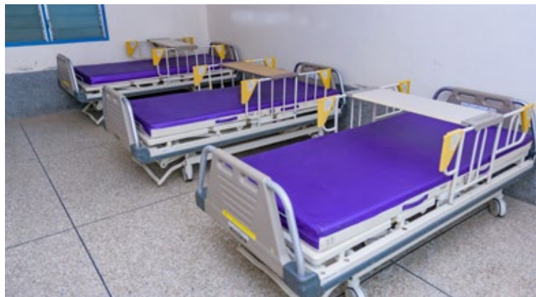
Some New Patient Beds in a Ward