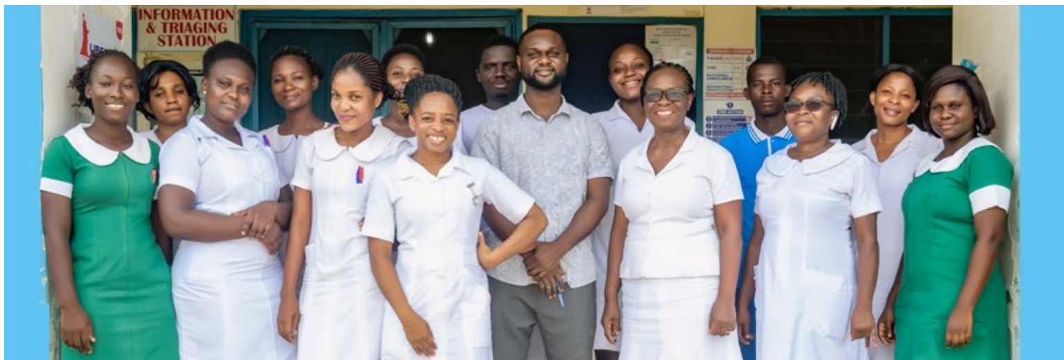
Grateful Staff of Hope Christian Hospital