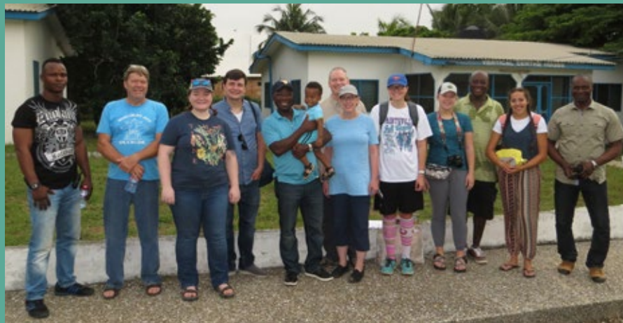
Ohio Valley University Group & Ghanaian Guides