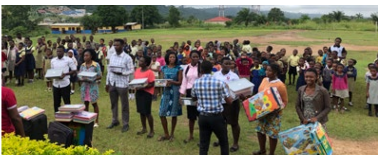
Teachers of Church of Christ School Receive Supplies for their Various Classes from Heartbeat for Hope