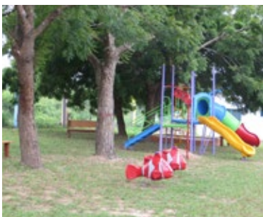
Rides, Slides, Sandpit and Benches Installed by and with the Help of Heartbeat for Hope