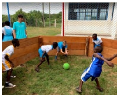
Heartbeat for Hope Team Helps Elementary School Children at Hope Christian Academy Use New Playground for the First Time