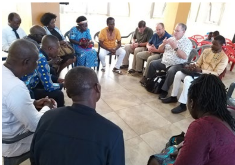
Dials Meet with Leaders of Nsawam Road Church of Christ Deaf Ministry