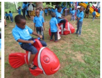
Excited Children at the Hope Christian Academy Nursery School Try Out the Newly Installed Playground Sets