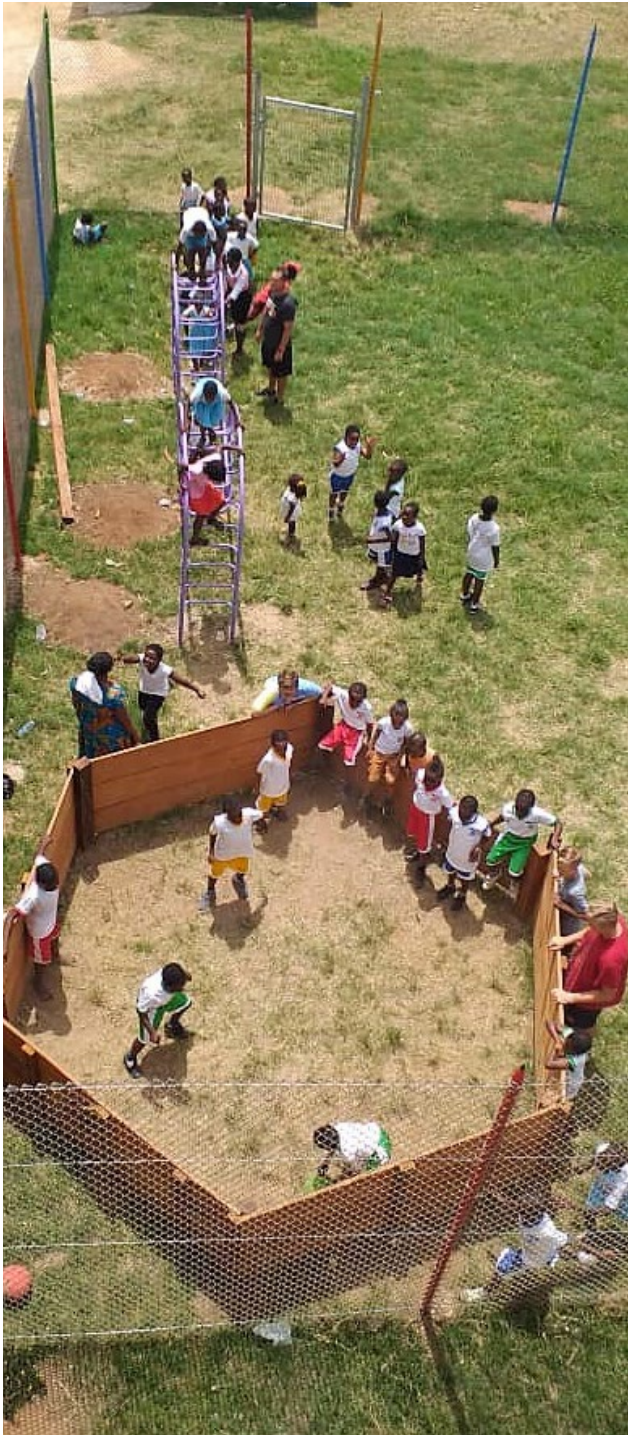
Children Play at Hope Christian Academy in Newly Constructed Playground

H earbeat for Hope has gifted Hope Christian Academy with a new playground for the children of the creche through kindergarten classes (aged from 2 to 5 years old). It is a priceless gift that has brought new life to the nursery school and made school more fun for the children. The playground has been fenced off for the security of the children and also to keep away the older children, many of whom want to play at the playground even though the equipment there are not meant for their age group.