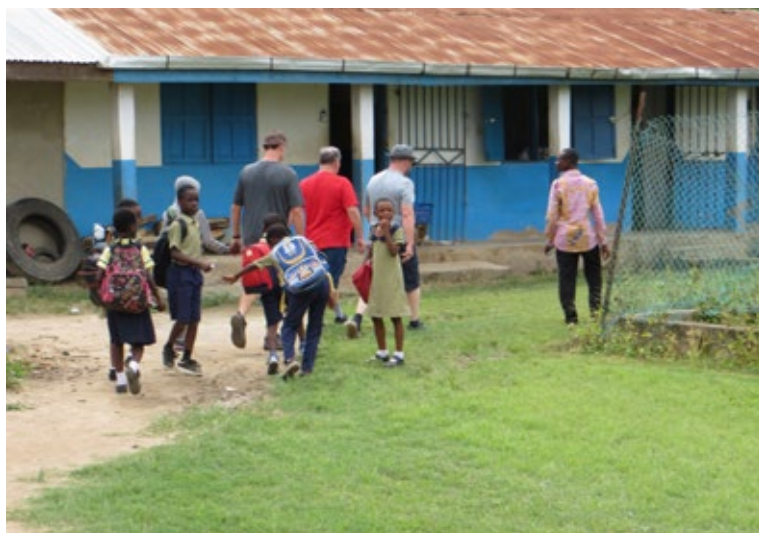
Dials Tour Campus of Church of Christ School at Nkwatia