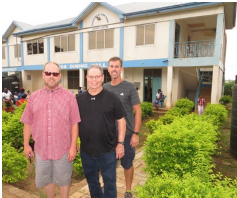
Dials Visit Hope Training Institute