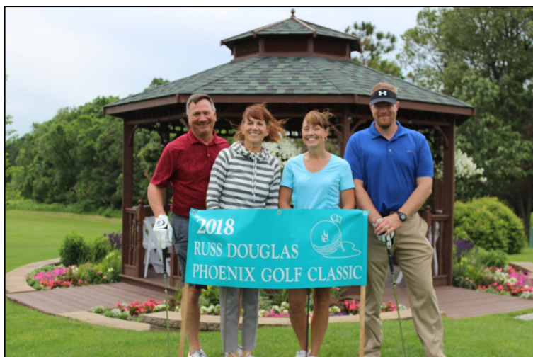
Russ Douglas Phoenix Golf Classic brought in $39,117.95