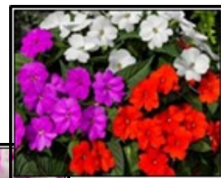
Gerten's Plant Sale brought in $4,222.51