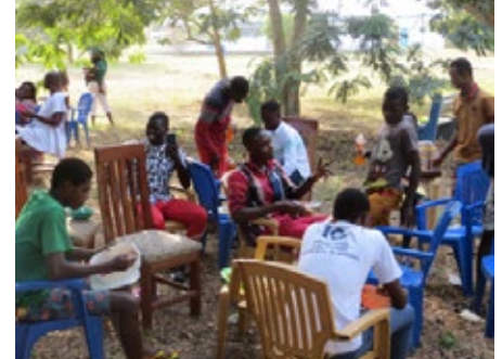
Serving and eating went on simultaneously.