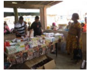
Patient waits for drugs at mobile clinic pharmacy