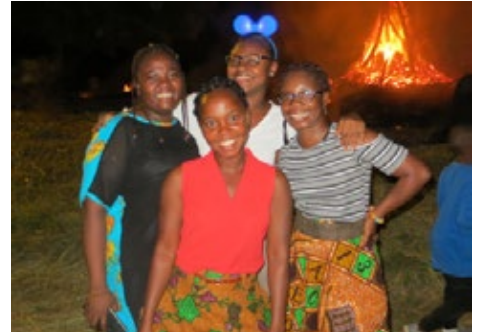
Independent children came home to welcome the New Year with family.