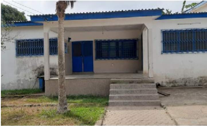
Traverse City Church of Christ House is 18 years old.