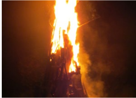
Traditional bonfire at Village of Hope on December 31 to welcome the New Year