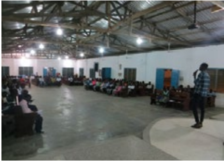
Prayer service to usher in the New Year 2020

Some of the happiest days at the Village of Hope are towards the end of each year and the beginning of a new year when our children return home for the holidays. Here are some pictures of the 2019 end-of-year and 2020 New Year homecoming activities and celebrations. 1