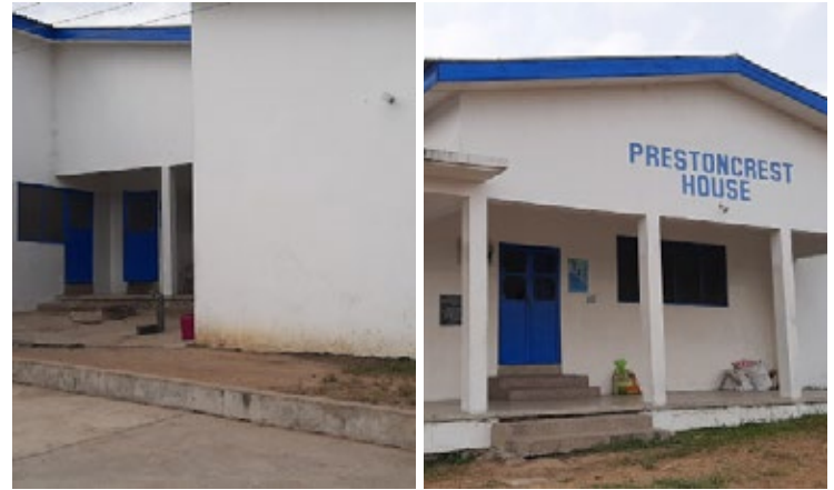
Prestoncrest Church of Christ House (housing 2 separate homes) is 12 years old.

After many years of daily use by children, the facilities inside these buildings have been worn out. Window frames and wooden facial boards are rotten and need to be replaced. The cottages need to be painted as some homes have not been painted over the past 10 years.