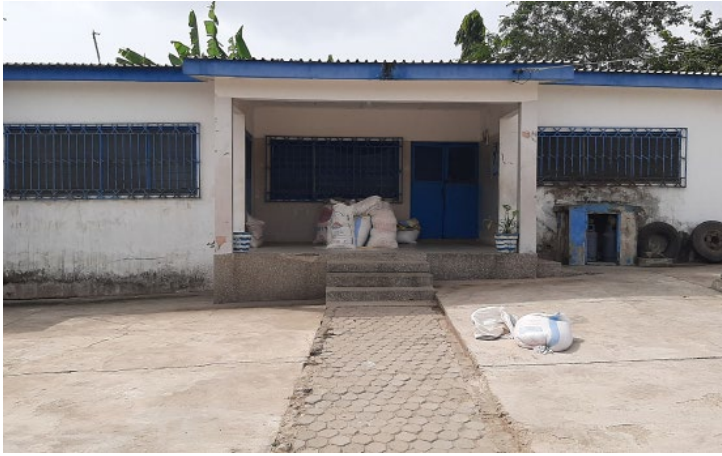
George & Mary Chisholm House is 18 years old.

T he children's homes/cottages have been inhabited and used every single day from the very first day children moved into them up to today. The first five children's homes are between 18 and 12 years old.