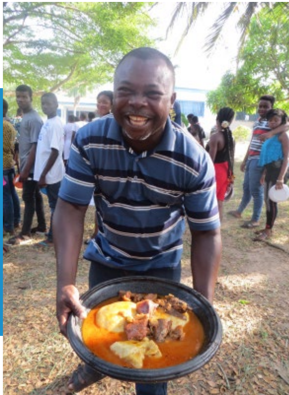
For the person who came on an empty stomach, there was more than enough to satisfy their hunger.