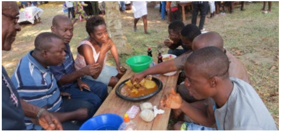
Communal eating from one big bowl