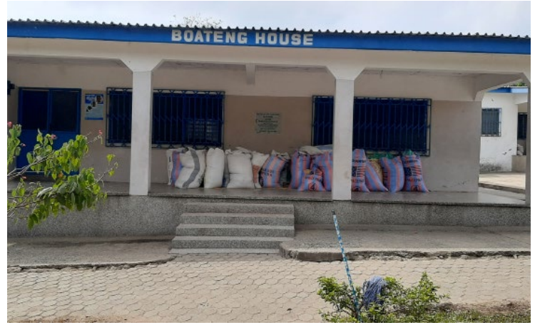
Douglas & Margaret Boateng House is 18 years old.