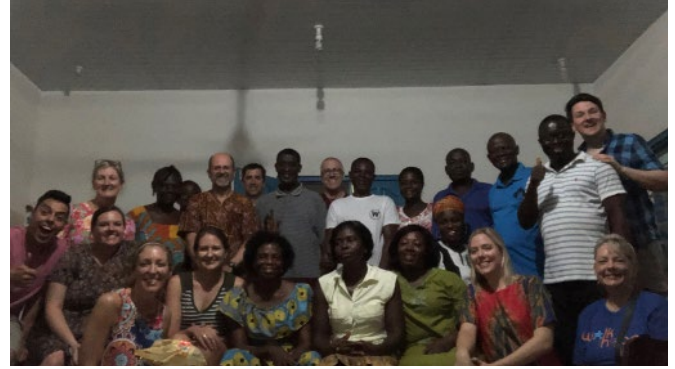
Members of the Heartbeat for Hope Team and House Parents of Village of Hope