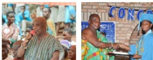
Chief of Fetteh speaks at Ghana's Independence Day Ceremony held at Fetteh (left) and congratulates a student of Hope College during graduation ceremony (right).