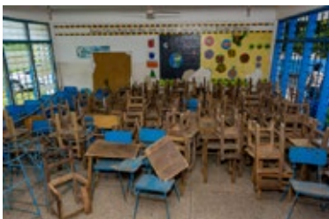
These are the broken chairs and tables that need to be replaced.

With $40 you can provide furniture for a child – furniture that will last for many years.