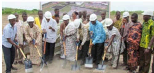
Chief of Fetteh (in traditional cloth in the middle) joins elders of churches of Christ for a groundbreaking ceremony for the commencement of the construction of Hope College on March 6, 2012.