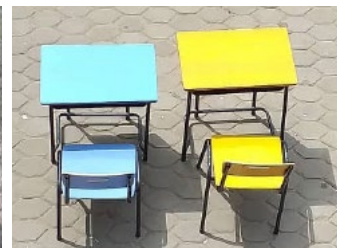
These are the chairs and tables we need to buy. Each set costs $40.