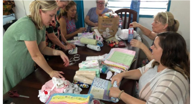
Heartbeat for Hope team wraps gifts for the children.