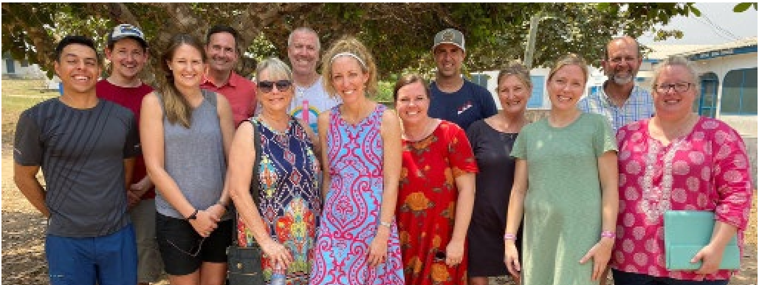
Heartbeat for Hope Team