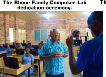
Technology allows dedication ceremony to be shared live on zoom