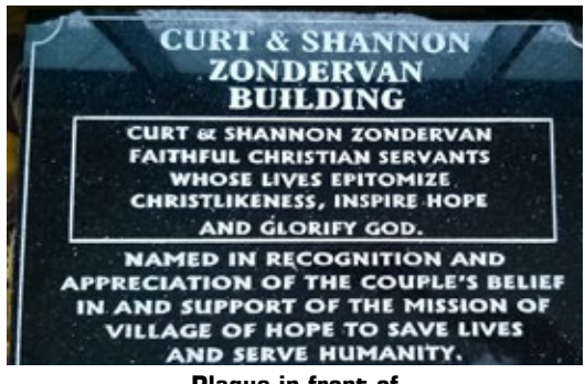
Plaque in front of Curt & Shannon Zondervan Building