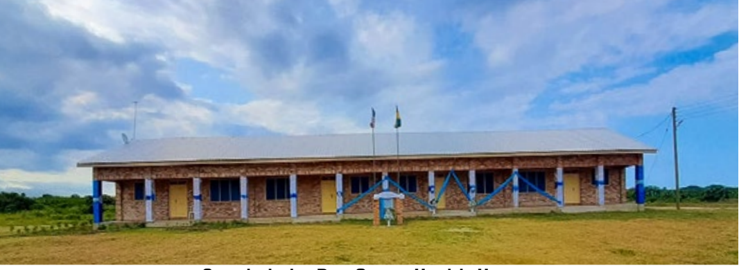
Commissioning Day: Oconee Hendrix House