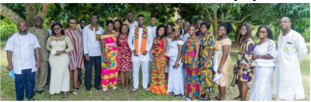
Some members of the Village of Hope family with the newly wedded couple.