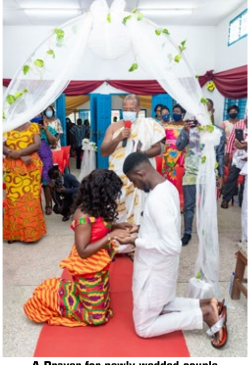
A Prayer for newly wedded couple