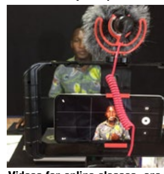
Videos for online classes are recorded at the studio in The Rhone Family Computer Lab