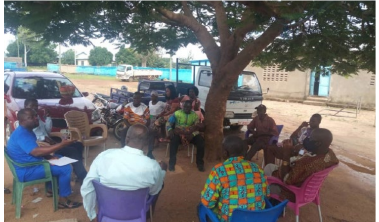
Village of Hope Management Team meets with Church Leaders from Bongo and Bolgatanga (capital of Upper East Region).