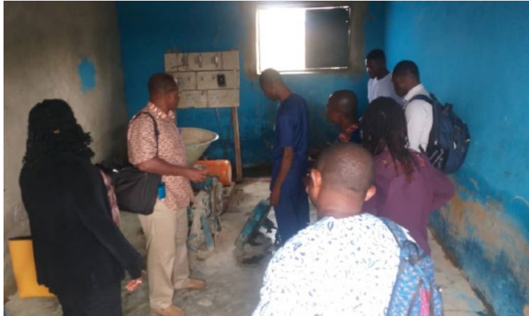
Village of Hope Management Team inspects facilities of Church of Christ Children's Home.

The Village church of Christ will continue to provide some support for the care of the children in the Home. However, the work is so expansive and the needs are so great that much more help is needed to support the numerous needy and destitute children in the region. With the help of God, working through your support, there will be hope for every child as we share the love of God to the neediest of children. 1