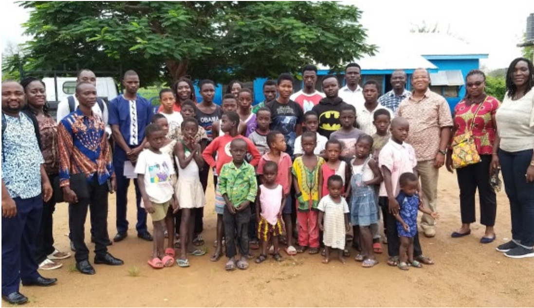
Children of Church of Christ Children's Home in Bongo with some members of the Village of Hope Management Team

As Village of Hope Takes Over the Running of Church of Christ Children's Home in Bongo