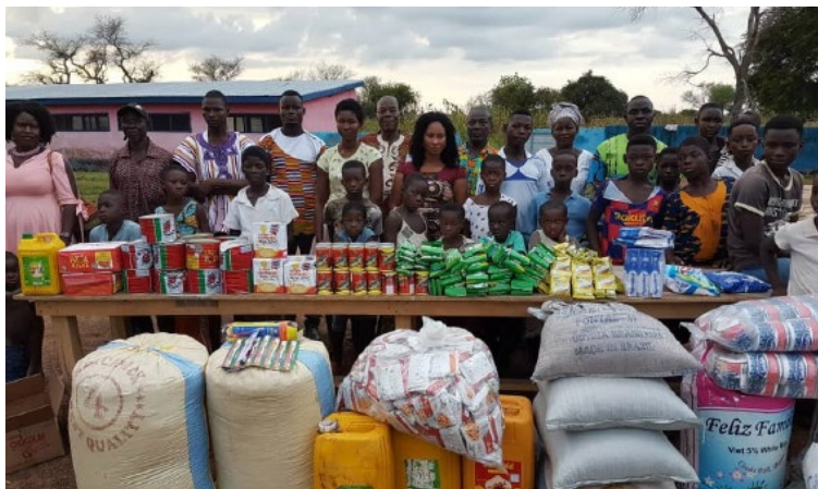
Village of Hope presents food and other supplies to the children of Church of Christ Children's Home in Bongo.