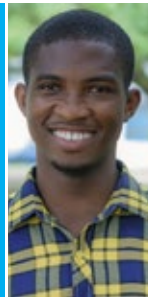
Charles Bukari Kwadaso Agricultural College; Dip. General Agriculture