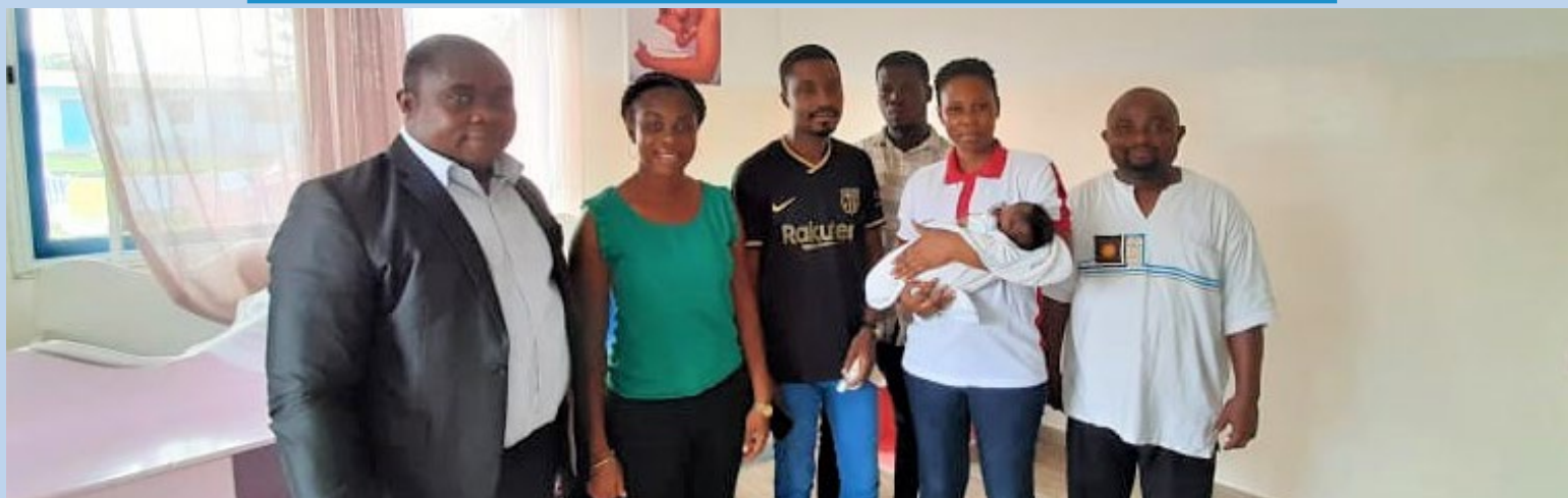
Village of Hope receives fifth baby from officials of the Department of Social Welfare.

H e was abandoned the very minute he entered this world with umbilical cord uncut and blood all over his body at the entrance of the toilet facility where he had been born. His shrill cry for help at about 1 AM that dark night attracted the attention of someone in the neighborhood who, upon sighting the abandoned baby, shouted for help. This brought the people in the nearby houses around, resulting in his rescue.