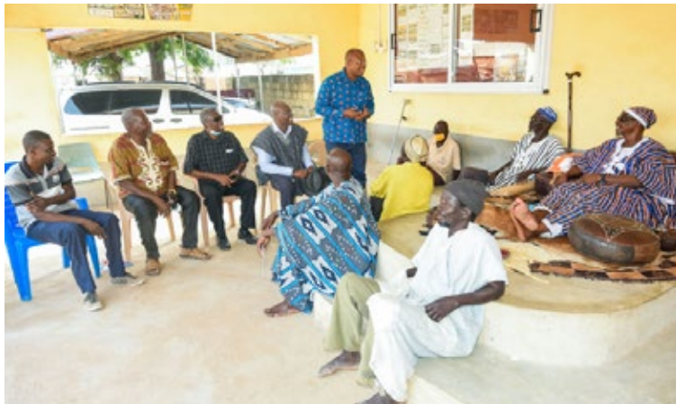
Members of Village of Hope Management Team and leaders of churches of Christ meet with Chief and Elders of Bongo.