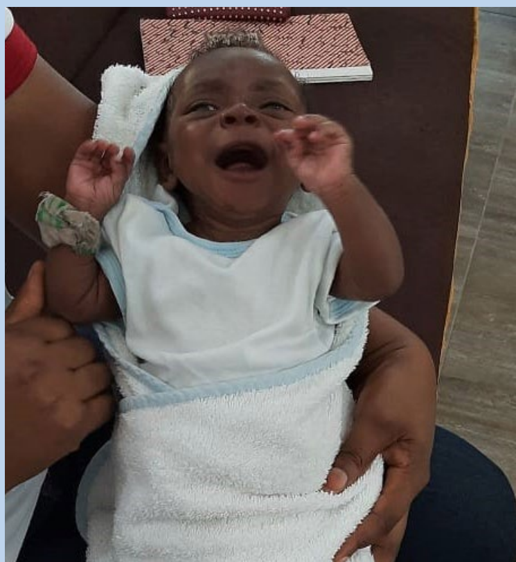
Tired and hungry, our fifth baby cries for his bottle as soon as he arrives at the Babies' Home.