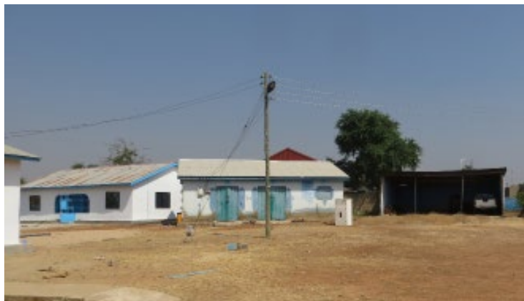
After renovations of the Church of Christ Children's Home in Bongo