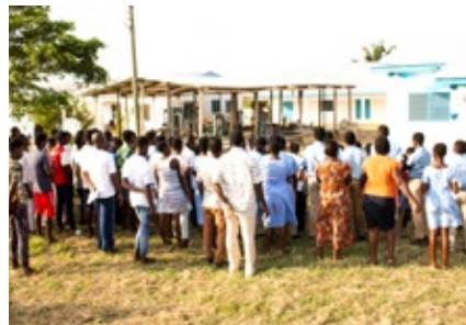
Staff and children of Village of Hope in front of Wise House