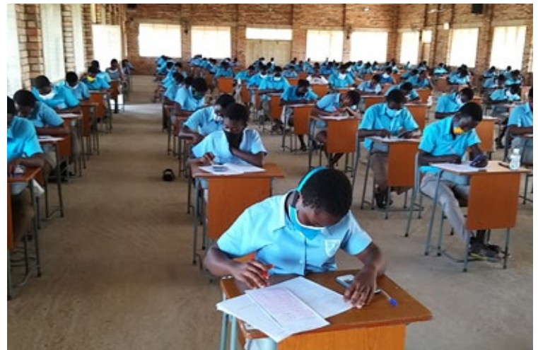
Hope College Class of 2020 exams in progress at the Hackmann Hall