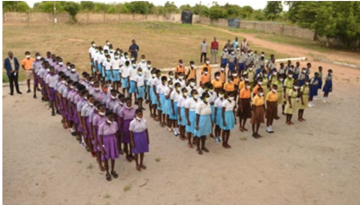
Hope Christian Academy students assemble with other 9th graders in front of their examination center.