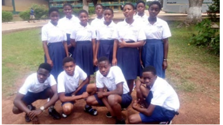
Church of Christ School Class of 2020 on last day of exams