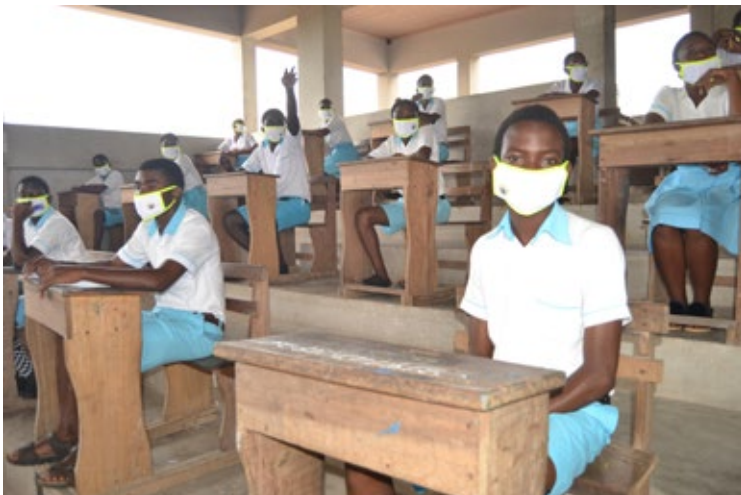
Hope Christian Academy 9th graders wait for their examination papers