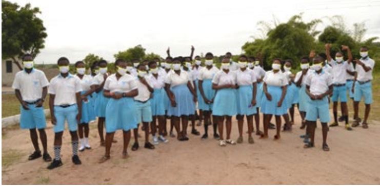
Hope Christian Academy Class of 2020

elementary school students passed the exams and qualified to enter high school. Our high school students passed at a rate higher than the national average with many qualifying to enter college. Please join us in giving thanks to God for answering our prayers and granting success to our students in their exams. 🙏