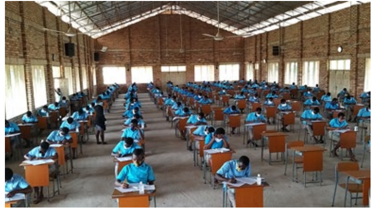
Hope College Class of 2020 exams in progress at the Hackmann Hall