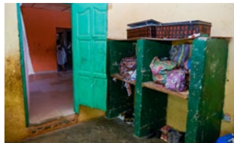
Before renovations of the Church of Christ Children's Home in Bongo