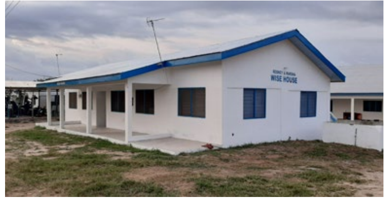
Rodney and Marsha Wise House

Owing to the COVID-19 pandemic, they were unable to travel to Ghana for the dedication. A virtual ceremony was held instead. 📺