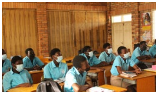
Hope Christian School, Hope Christian Academy and Hope College students in the classroom after the Covid-19 break from school