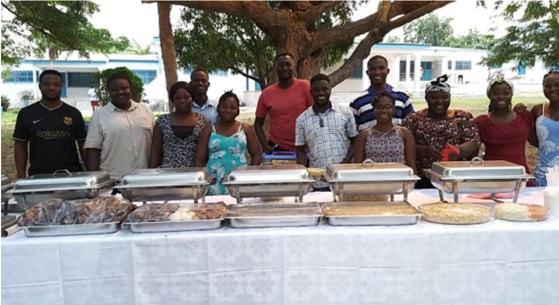
Independent children of Village of Hope throw a party for their younger siblings on Fetteh Campus.

As is the tradition of Village of Hope, many of the children in high school, college (university) and those who are independent returned to the Fetteh campus of Village of Hope for last year's end-of-year homecoming. The 2020 homecoming witnessed one of the highest number of children returning home. We think the reason for this was because until December, no one was permitted to visit the Village of Hope campus as a means of protecting the children and residents of the campus from COVID-19. All the children living outside the campus had therefore not been able to enter the campus since March 2020. Many, therefore, took advantage of the homecoming to visit their "parents" and "siblings" on campus.