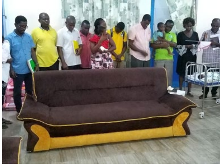
Leaders of the Church of Christ at Village of Hope visit and pray for babies in the Babies' Home.