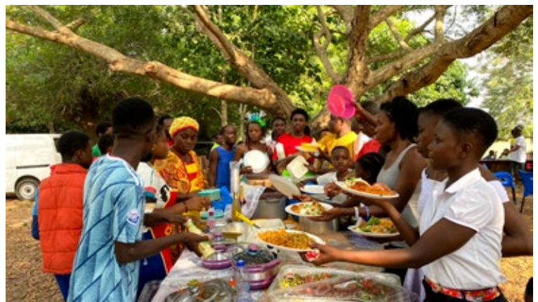
Independent children of Village of Hope throw a party for their younger siblings on Fetteh Campus.