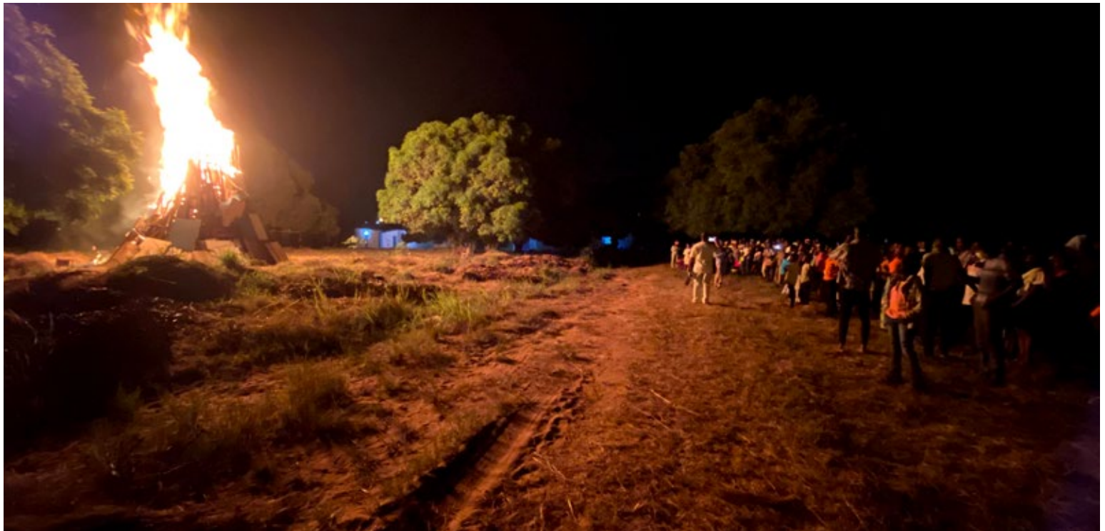
Bonfire on the Eve of The New Year 2021

On Sunday, January 3, we gathered for worship. After the worship service, some of the independent children and older children in college began to say goodbye and depart for their various places of residence as they had to go to work the following day. The next day, many more bid us farewell and departed. Others stayed for a few more days before leaving campus. Even though we knew they would be leaving, seeing them go was difficult. A few years ago, they were little children in our homes but now, they are all grown up and living independently. The cords of love that have bound us together as one family are so strong that it made saying goodbye to them so difficult. We are, however, grateful to God that we get the opportunity each year to enjoy a reunion with them during homecoming. We are happy that they are doing well on their own and making a real difference in the world. 📍