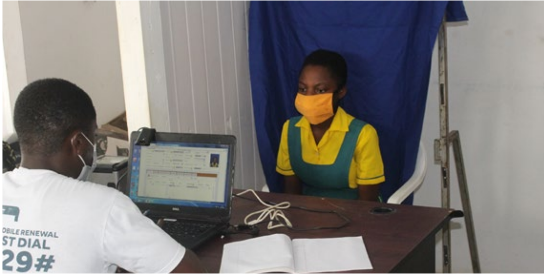
An official from the National Health Insurance Scheme registering a student from the Fetteh community.

Recent research has shown that, each year, about 150 million people use more than two-fifths of their income reserved for items other than food, to cover their family and personal health expenses. In fact, 100 million people are pushed below the poverty line every year because they have to pay ready cash to cover more than half of their healthcare costs. As a lower middle-income country in Africa, a significant part of the population of Ghana falls within the demographic that suffers financially whenever they have to spend on healthcare. Until 2003, Ghana's healthcare financing was based on a cash-and-carry system, meaning that patients had to pay cash before receiving medical care at any facility, public or private. There were few community healthcare insurance schemes but most poor people could not afford healthcare in general. The National Health Insurance Scheme (NHIS) was established in 2003 to enable people living in Ghana and those visiting the country have easy access to healthcare without the need to have cash readily available.