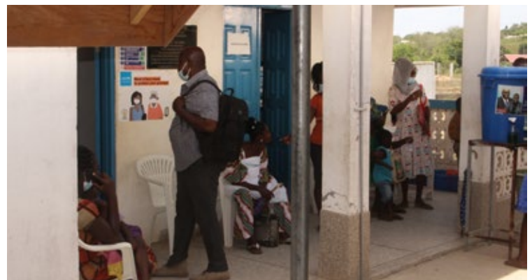
Scenes from the free NHIS registration organized by Hope Christian Hospital.