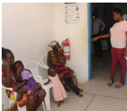
Other members of the community waiting for their turn to start the NHIS registration