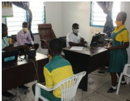
Some students from the Fetteh community at the NHIS registration room

The National Health Insurance Scheme is mainly funded by taxes and, to enroll in the national health