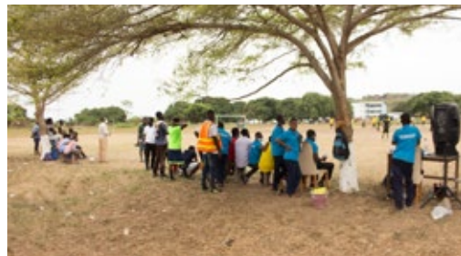
Shots from the soccer tournament organized by Hope Christian Hospital.