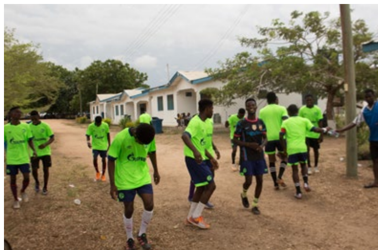
Shots from the soccer tournament organized by Hope Christian Hospital.