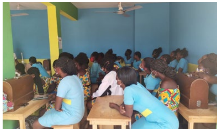
Staff of Hope Christian Hospital give a health talk to a sewing group at Senya Bereku.