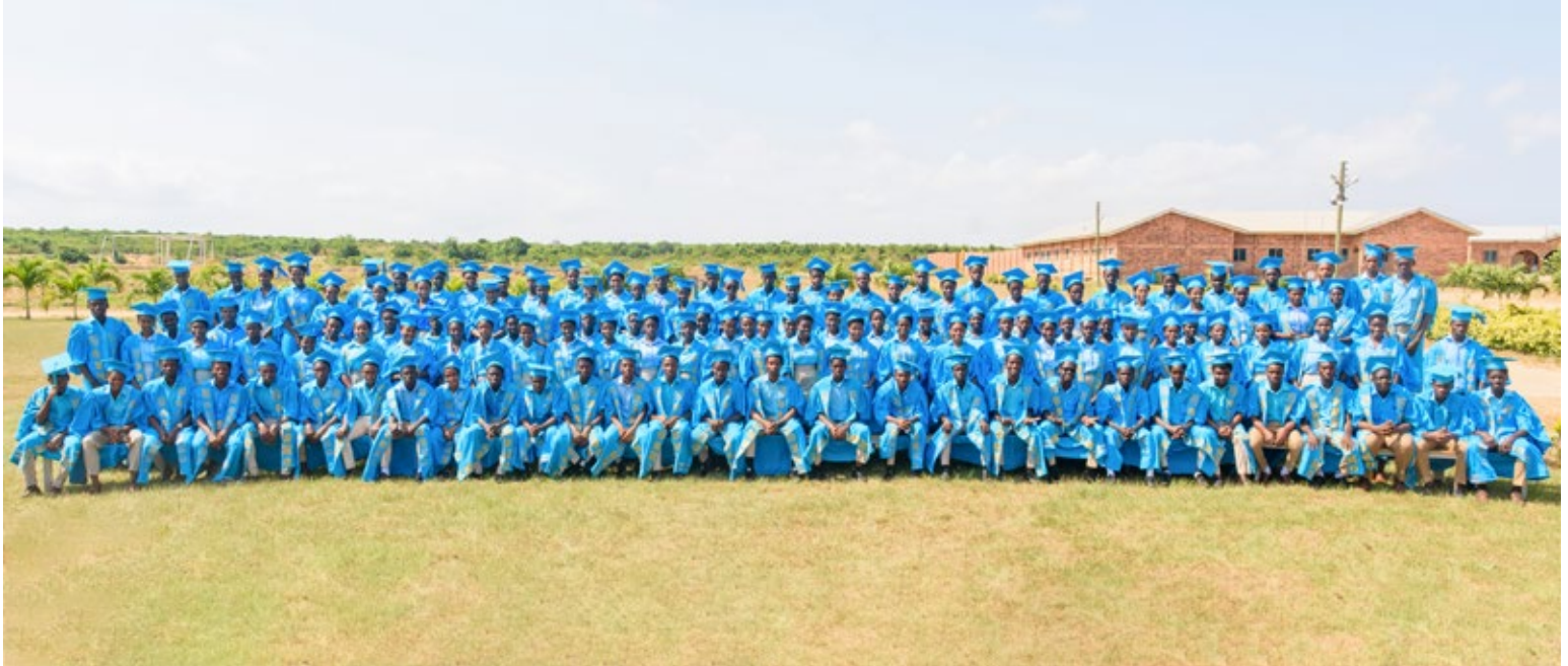
Hope College Class of 2020

The year 2020 was a unique year for high school seniors around the world and the Hope College Class of 2020 was no exception. As they wrote their final exams and prepared for their graduation ceremony in September of 2020, it became apparent that the ceremony would not be possible because of national COVID-19 restrictions. For this reason, after their final examinations, all students left the Hope College campus and waited for their examination results. On September 4, 2021, nearly one year after their graduation ceremony was originally scheduled to happen, the Class of 2020 showed up on the campus of their alma mater for an official graduation ceremony.