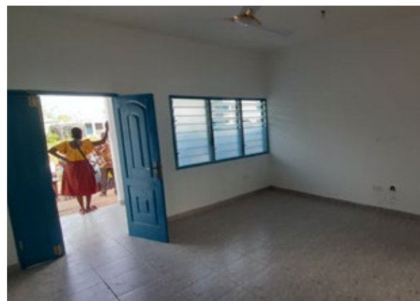
Inside the living room of one apartment of the duplex