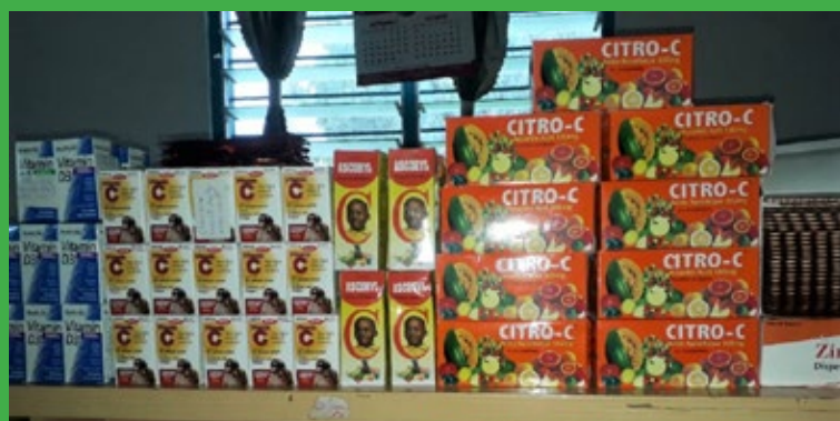
The first consignment of a variety of vitamins for all age groups was purchased and distributed to the children.