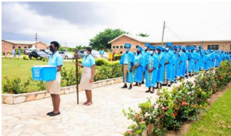
School prefects (currently in the 11th grade) lead the procession of graduands with the symbols of Hope College - the Bible and the Mace.

Two months of examinations finally culminated in a graduation ceremony, according to schedule, for the Hope College Class of 2021 on October 9, 2021. This group had, only a month earlier, witnessed the official graduation of their predecessors (see Page 4 for details).