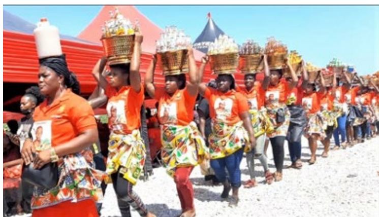
Guests bring drinks and food items to the royal family as a sign of support.