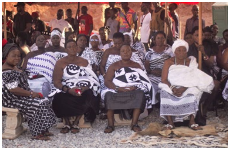
Queenmother of Fetteh and her courtiers wear black and white cloth on Sunday as a sign of gratitude and thanks.