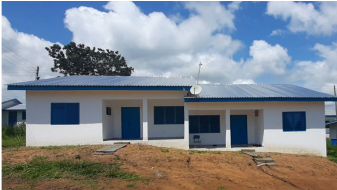
Front view of John & Anne Hambrick House