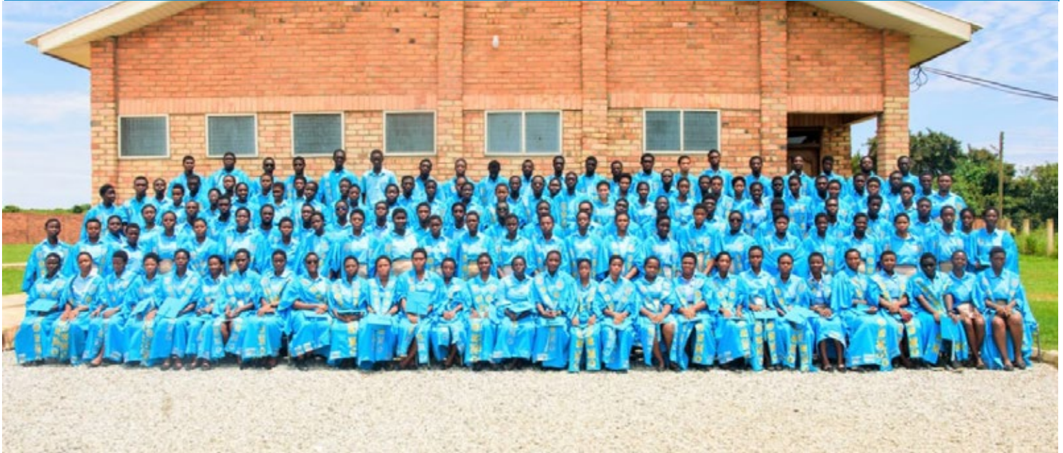
Hope College Class of 2021