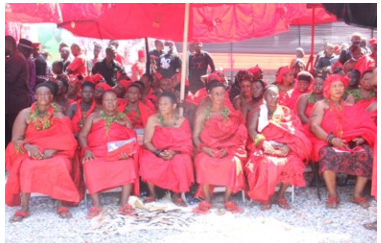
Queenmother of Fetteh and her courtiers sit to receive greetings from guests during funeral activities.