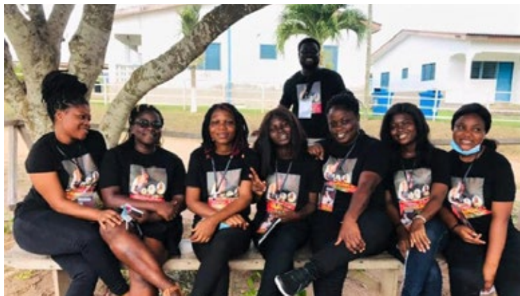
A team of adult children of Village of Hope worked in various supporting roles during the funeral of Nana Abor Yamoah II.