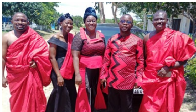
Representatives of Village of Hope prepare to attend the funeral of the late chief.