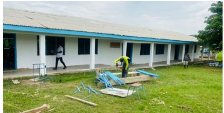
Painters prepare new battens for the windows.