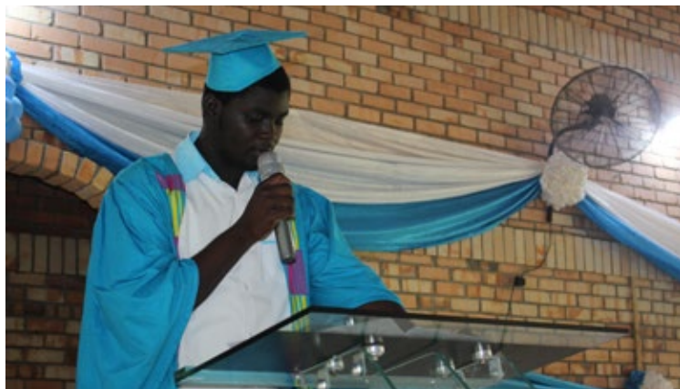
Ninth grade class speaker addresses the audience.