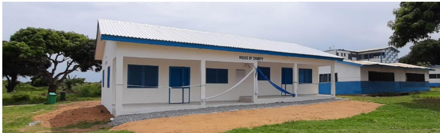
Newly constructed House of Charity