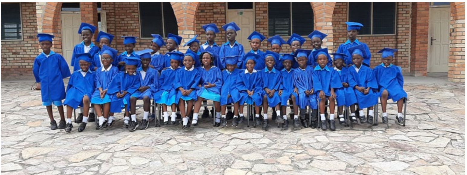
30 children graduate from preschool.

Our fervent prayer is that the years that the ninth graders spent at Hope Christian Academy will yield positive results in their lives. We also hope that all our children who have graduated kindergarten will come back to school in January 2022 to start the first grade at Hope Christian Academy. 📞