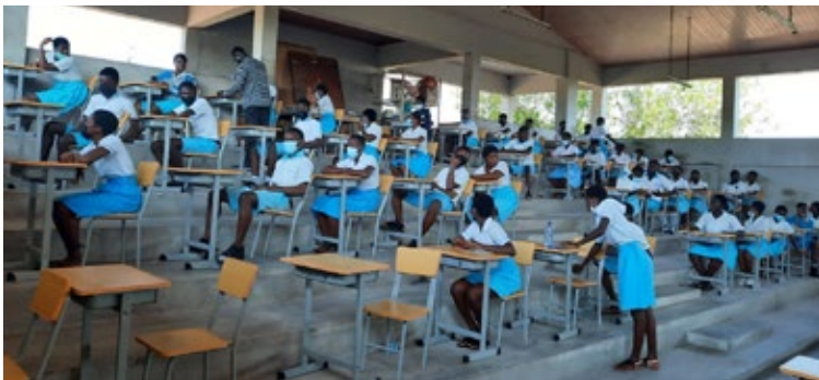
Some students of Hope Christian Academy settle down for that day's exam.

From Monday, November 15 to Friday, November 19, all ninth graders in Ghana gathered at various examination centers across the country to write the Basic Education Certificate Examination (BECE), an exam that currently determines entry into high school but will soon be phased out. Hope Christian Academy's 45 ninth graders went to Fettehman Senior High School every day to write their exams while the six pupils at our school in Nkwatia went to St. Peter's Senior High School. Now that the exams are over, join us to pray for the safety of these children as they wait for the results and prepare for high school in 2022. 📞