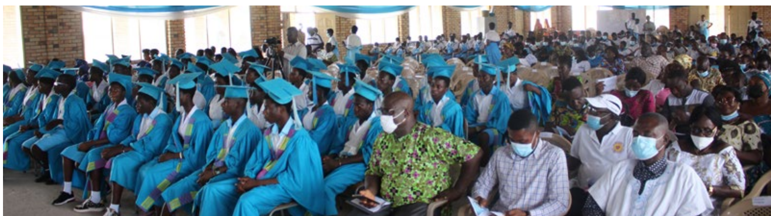
A section of the audience at the graduation ceremony in Hackmann Hall