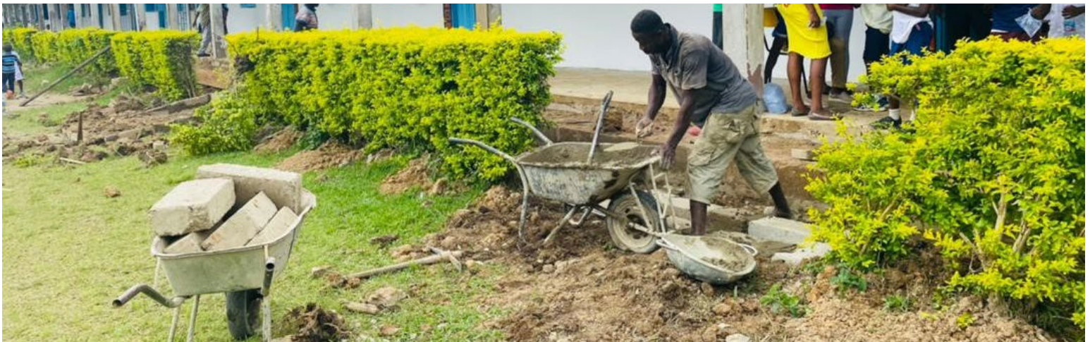
Masonry work in progress at the front of the primary school building: steps are repaired.