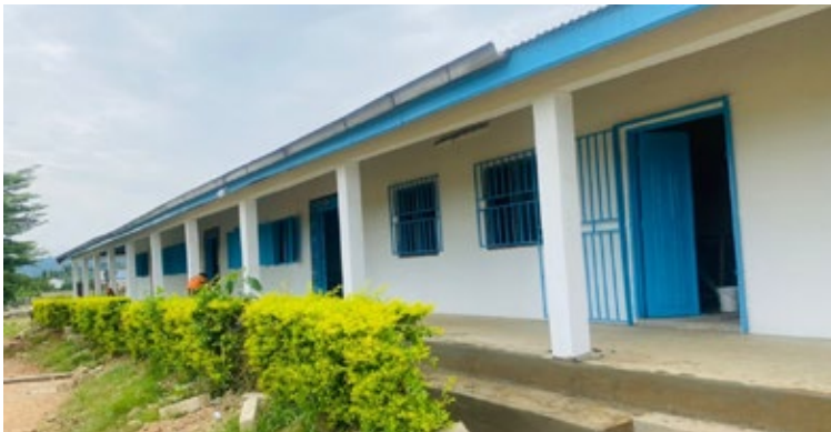
Paint job at the back of the primary school building is nearly completed.