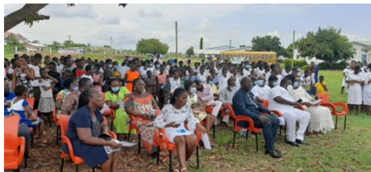
Section of audience at commissioning ceremony