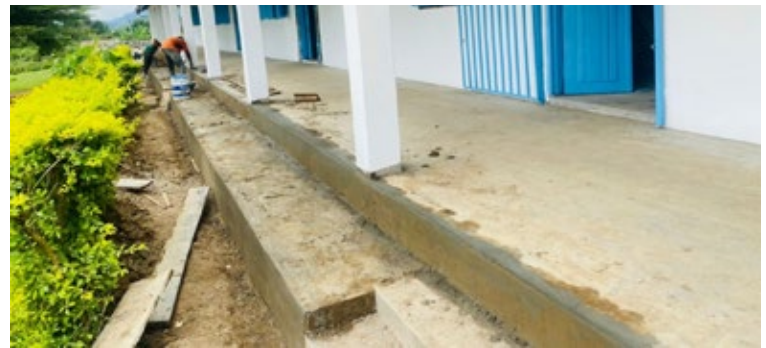
Steps and skirting at the back of the primary school building are complete.

The items on our “Vision 2020” wish list included, for our school in Nkwatia, funding for the construction of a nursery school building, new furniture for classrooms, and the renovation of our existing primary and junior high school buildings. We initially only received funds for the construction of the nursery school building, and then we got the donations for the classroom furniture. We have now received funds for the renovation of the existing buildings. Masons, carpenters, painters and other artisans have been engaged to do the renovations and we hope to complete the work by the end of the November. 🔗