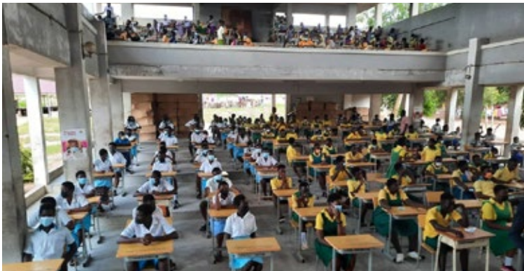
Students of Hope Christian Academy and other schools share the exam hall.

From Monday, November 15 to Friday, November 19, all ninth graders in Ghana gathered at various examination centers across the country to write the Basic Education Certificate Examination (BECE), an exam that currently determines entry into high school but will soon be phased out. Hope Christian Academy's 45 ninth graders went to Fettehman Senior High School every day to write their exams while the six pupils at our school in Nkwatia went to St. Peter's Senior High School. Now that the exams are over, join us to pray for the safety of these children as they wait for the results and prepare for high school in 2022. 📞