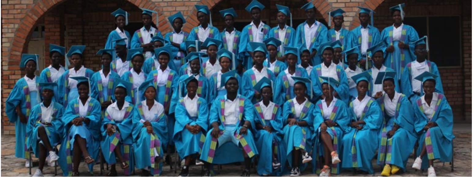
Hope Christian Academy's graduating class of 2021.

The 15-year-old tradition of holding graduation ceremonies for ninth graders of Hope Christian Academy continued on Saturday, November 20, 2021, right after the children finished their exams. The event also doubled as a graduation ceremony for the kindergarten class preparing to start first grade in January 2022. In all, there were 45 children in the 9th grade graduating class and 30 children in the kindergarten graduating class.