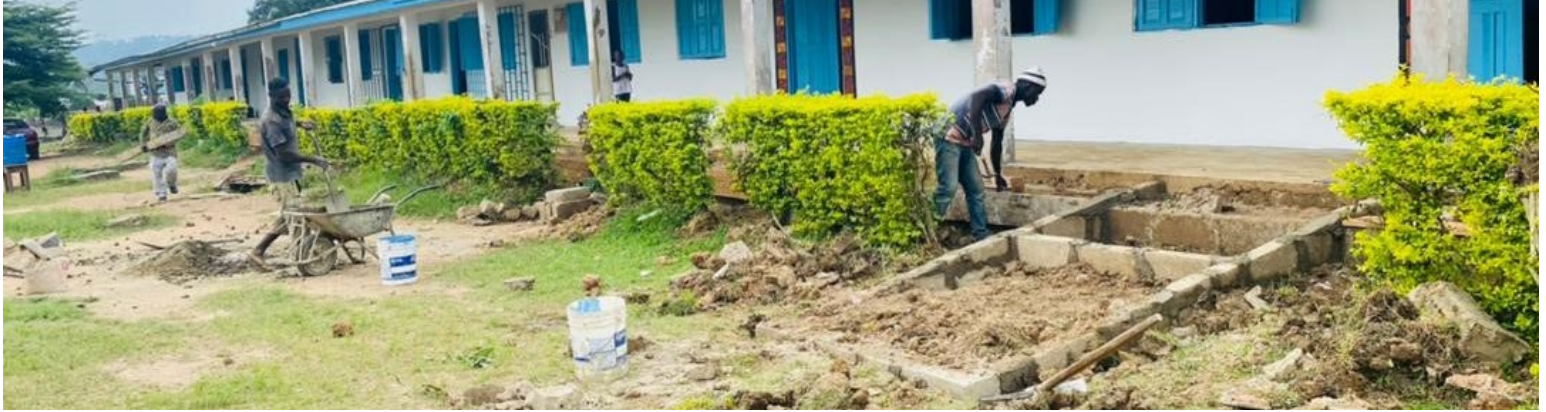
Masonry work in progress at the front of the primary school building: ramps for accessibility are constructed.

The items on our “Vision 2020” wish list included, for our school in Nkwatia, funding for the construction of a nursery school building, new furniture for classrooms, and the renovation of our existing primary and junior high school buildings. We initially only received funds for the construction of the nursery school building, and then we got the donations for the classroom furniture. We have now received funds for the renovation of the existing buildings. Masons, carpenters, painters and other artisans have been engaged to do the renovations and we hope to complete the work by the end of the November. 🔗