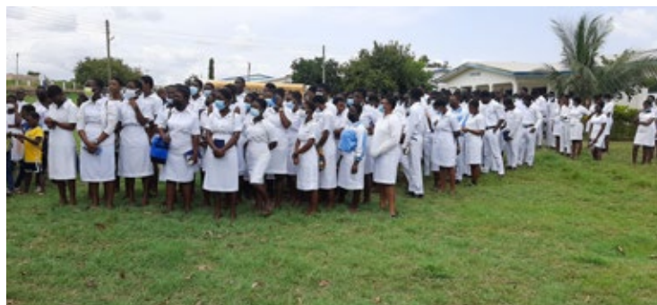
Students of Hope College