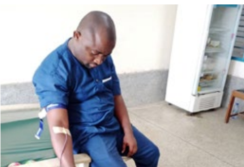
Staff from various ministries of Village of Hope get their blood drawn to help save lives.