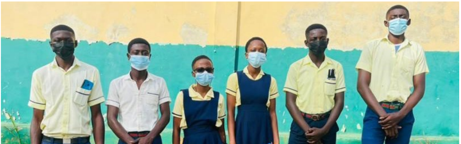
Six ninth graders of our school in Nkwatia pose for a photo outside the exam hall at St. Peter's Senior High School.