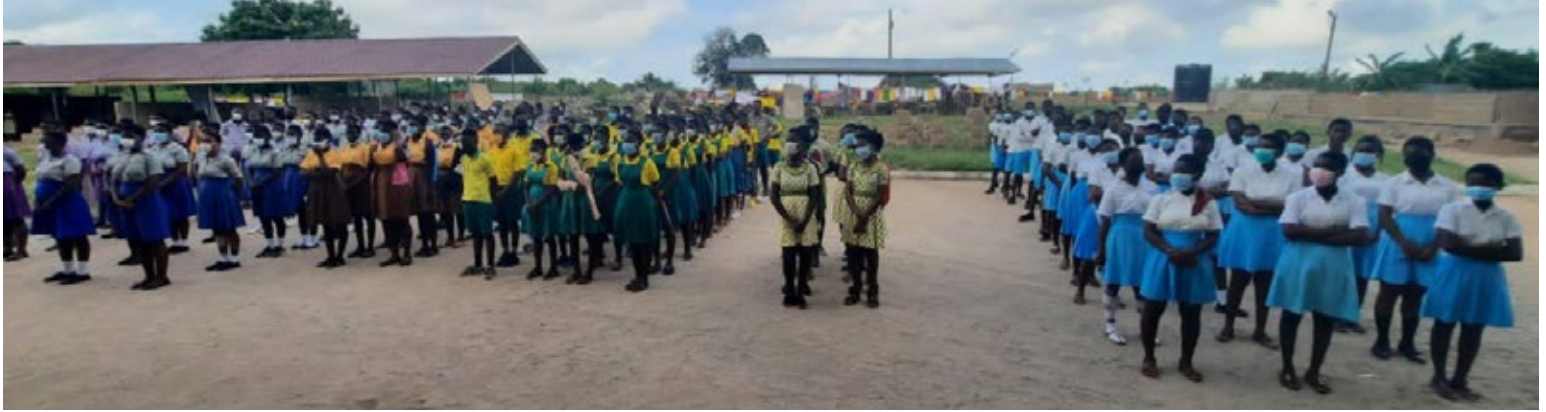
Morning assembly at the Fettehman Senior High School exam center involves Hope Christian Academy and five other schools.