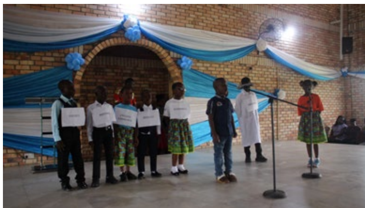
The graduating kindergarten class performs various poetry recitals, songs, and dances to showcase what they have learned in nursery school.