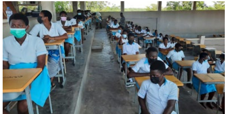
Some students of Hope Christian Academy get ready for that day's exam.