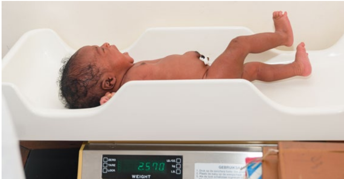
An abandoned baby arrives at Hope Christian Hospital.

The shrill cries of a baby cut through the stillness of the night. Soon, the lights of nearby houses began to come on, one after the other, as the occupants filed out of their homes towards the sound of the crying baby. What they saw wiped away all sleep from their eyes.