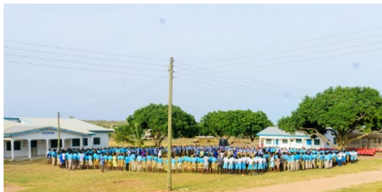
The entire Village of Hope family gathers for the groundbreaking ceremony.

C hildren, pupils and students from Hope Children's Village, Hope Christian Academy and Hope College joined staff from the various subsidiaries of Village of Hope on the Fetteh campus for a groundbreaking ceremony for construction works to begin on two babies' homes in the late afternoon of Wednesday; March 23, 2022. The homes are being sponsored by the McClanahan Family of Edmond, Oklahoma and Heartbeat for Hope, a non-profit Christian organization in Edmond, Oklahoma. 📰