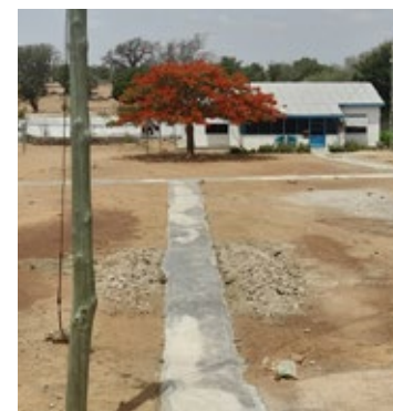
Walkways at Hope Children's Place