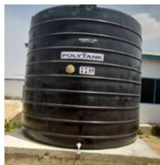
Water storage tank