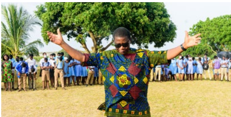
Minister Amoah Wontumi offers prayers during the groundbreaking ceremony.