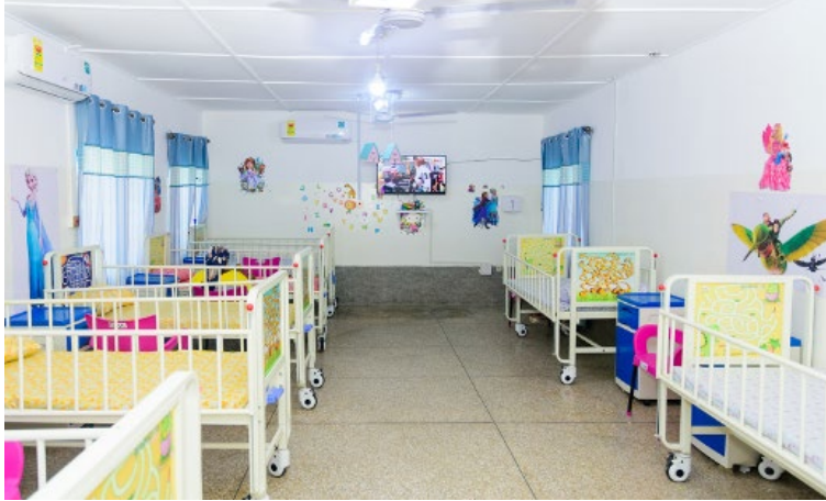
Rich & Renai McClanahan Pediatric Ward

The male ward was named the George W. "Bill" Knight Ward; the female ward was named the Anna Beth Daugherty Knight Ward; and the children's ward was named the Rich & Renai McClanahan Pediatric Ward. 📷