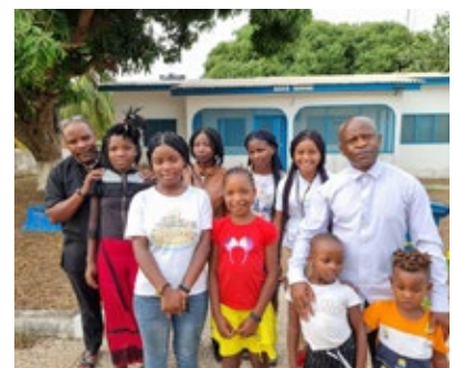
Children from DRC and their chaperons arrive at the Fetteh campus of Village of Hope.