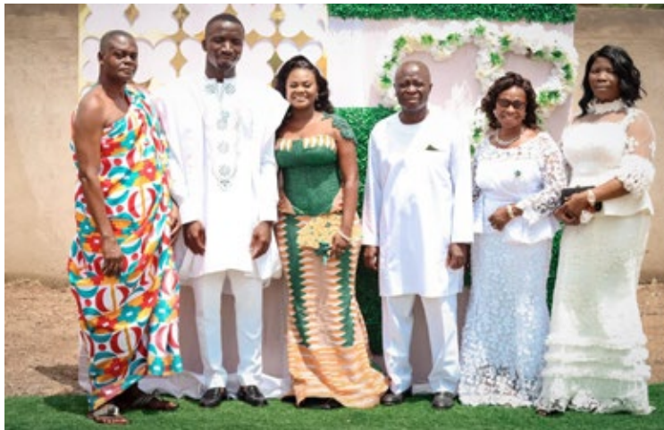
The bride and groom with their parents at the traditional marriage ceremony