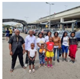
Children from DRC and their chaperons arrive at the airport in Accra, Ghana.

It is our prayer and hope that after their education and training at the Village of Hope, they will return to their country to be ambassadors of Christ, a light to their people, well equipped to lead in the transformation of that great African nation. 🙏