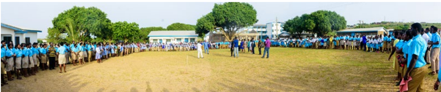
Children, pupils, students and staff gather for the groundbreaking ceremony.