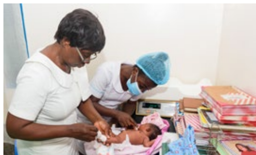
Nurses attend to an abandoned baby.

Today, if you see that lovely, beautiful, cute child, you would never know that she was abandoned minutes after she was born, and to date, no one has seen the woman who gave birth to her. She was abandoned to die but she was rescued and brought to the Village of Hope to live. Through the loving care of God's children, she is a living testimony of the goodness of God.