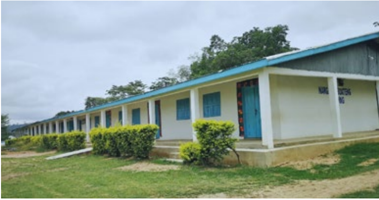
Margaret Boateng Building (Grades 1 - 6)