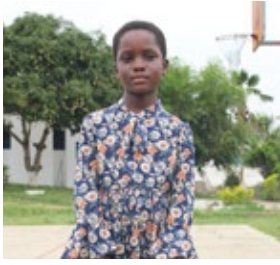
Sakiwaa Grade 3