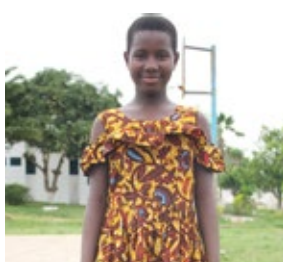
Vida Grade 3