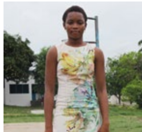
Shorla Grade 6