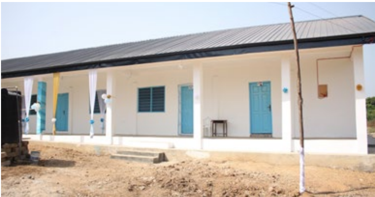
Naoma Creda Parks Building (Preschool: Crèche - Kindergarten)