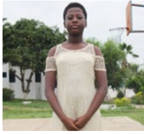
Queenstar Grade 6