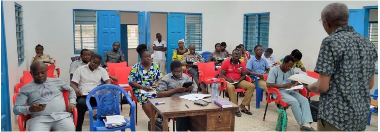
Training program on discipleship in session

Participants learned about the alarmingly high number of people who are perishing without Christ and effective methods of converting them to Christ. At the end of the training, participants were challenged and motivated to be true disciples of Jesus Christ and to make disciples for Christ. The training is already bearing fruit with an increase in the number of those who have given their lives to Christ on the Fetteh campus of the Village of Hope since the end of the training. 🔗