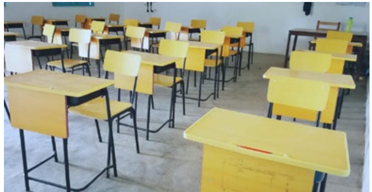
Hope Ridge School receives 20 new desks and chairs.

Many exciting things have been happening at Hope Ridge School since December last year. First, the name of the school was officially changed. Next, a new nursery building was dedicated for use by the school and two existing classroom buildings were renovated and named. Then, the classrooms were furnished with new furniture so every student has a new desk and a new chair to use. Afterwards, the school introduced new uniforms for the students with new colors and designs. All these have helped to increase student enrolment. We recently had to purchase 20 new desks and chairs to meet the increasing enrolment.