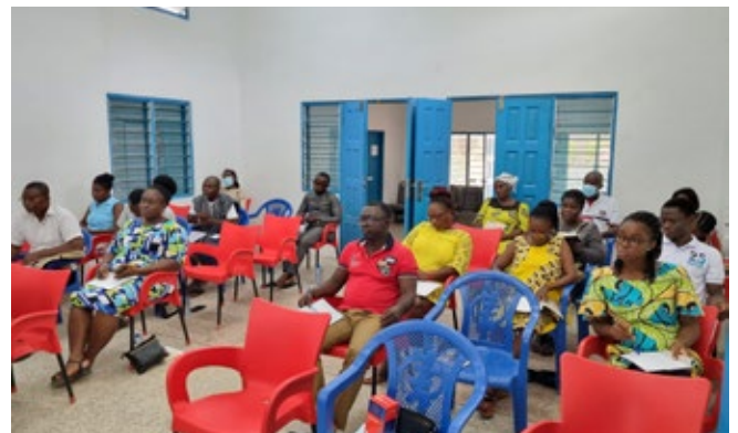
Adult members of the church of Christ at the Village of Hope during the training session.