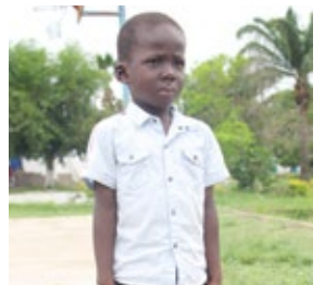
Douglas Nursery 2