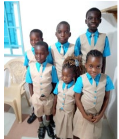
Some students in Hope Ridge School's new uniforms