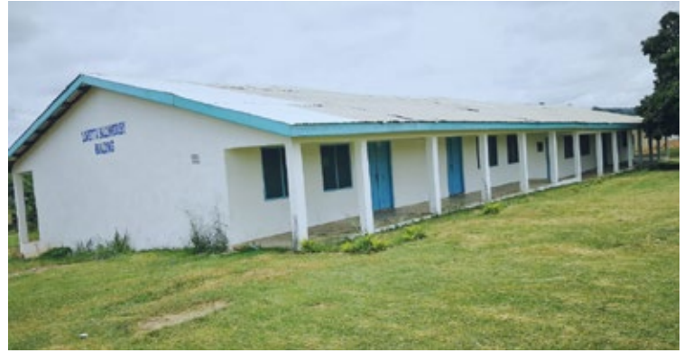
Loretta Billingsley Building (Grades 7 - 9)