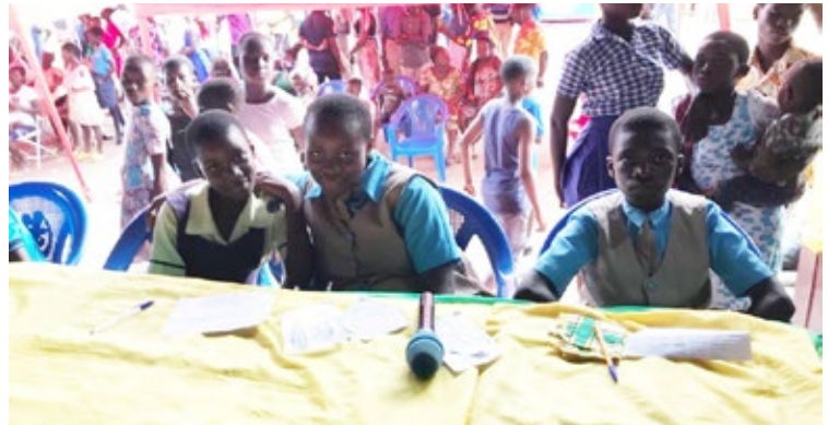
The winning team of the Spelling Bee Competition

We are excited that many people are beginning to recognize something we have known for a long time – the high quality of Christian education offered at Hope Ridge School. Join us to congratulate the administrators, teachers, and students of Hope Ridge School. 🙌