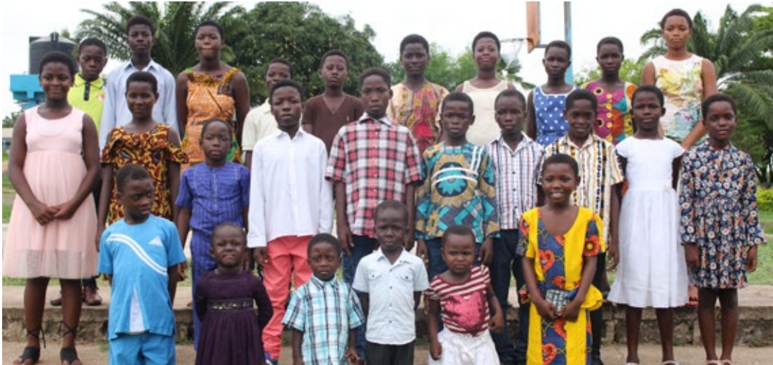
Some of the children who have recently found new life at the Village of Hope

No child should be left unloved, uncared for, and without hope. That is an ideal we strive for at the Village of Hope but is easier said than done because orphaned, destitute, and needy children in our society are so many. If this ideal situation is to be realized, then we need to have big open doors, big hearts, and a very big faith not to say "no" to any needy child who is brought to us. We need to have faith that our God will provide for every need.