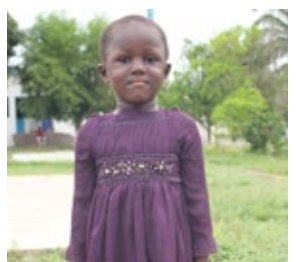
Magaret Nursery 1