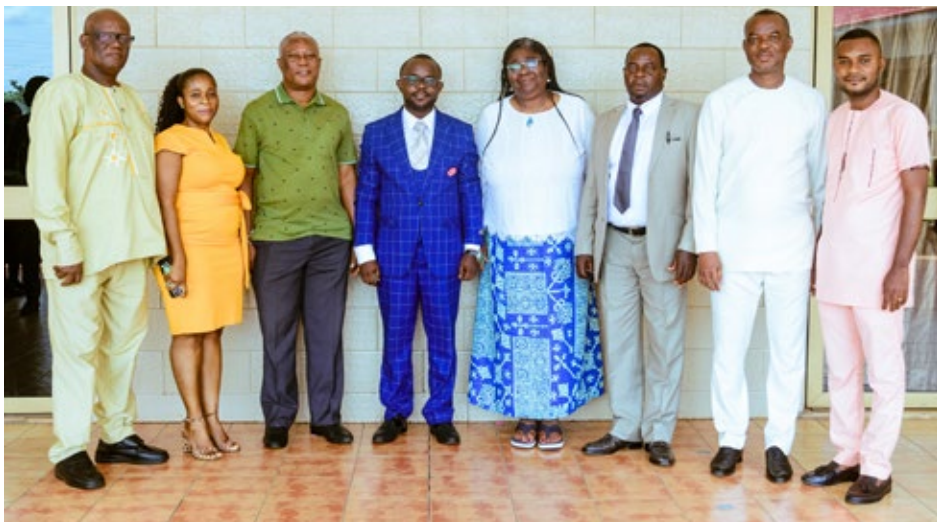
Members of the Hope Children's Village Board

Village of Hope is truly blessed to have such a committed group of wise, God-fearing men and women who serve pro bono on its boards. We thank God for such a great blessing. 🙏