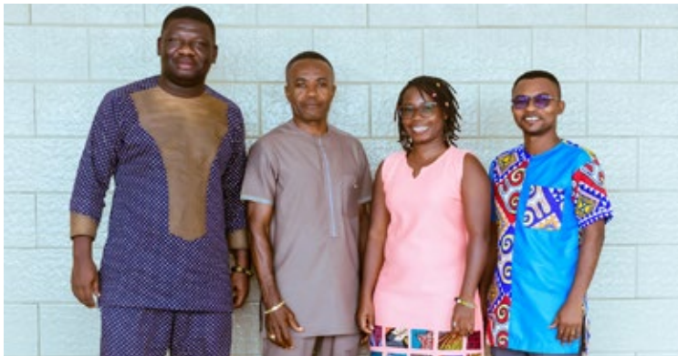
Members of the Hope Training Institute Board