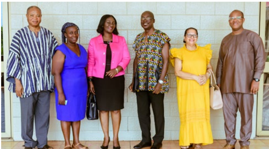
Members of the Hope College Board