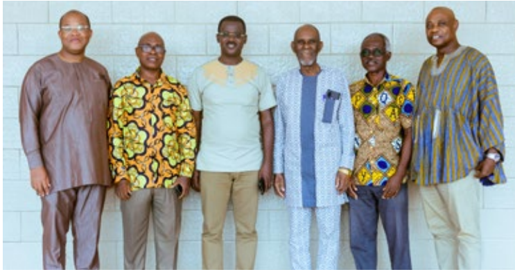
Members of the Village of Hope Group Board