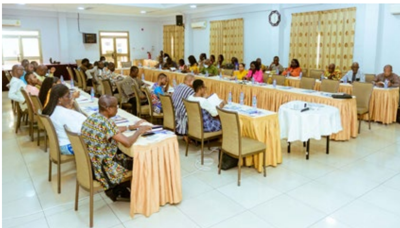
All-boards meeting in session