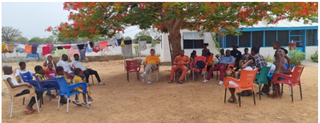
A family conversation under the shade of a tree on the Hope Children's Place campus