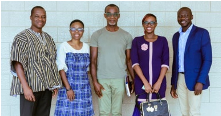
Members of the Hope Christian Hospital Board

Each of the ministries of Village of Hope (Hope Children's Place, Hope Children's Village, Hope Training Institute, Hope Christian Hospital, Hope Christian Academy, Hope Ridge School, and Hope College) has a Board of Directors that directs its work. There is also an oversight Board called the "Village of Hope Group Board" which reports to the oversight elders of the Vertical Centre church of Christ in Tema, Ghana.