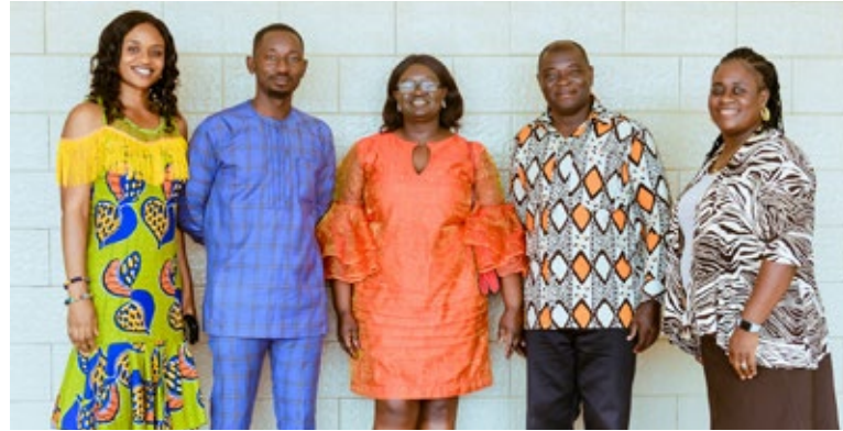
Members of the Hope Christian Academy Board