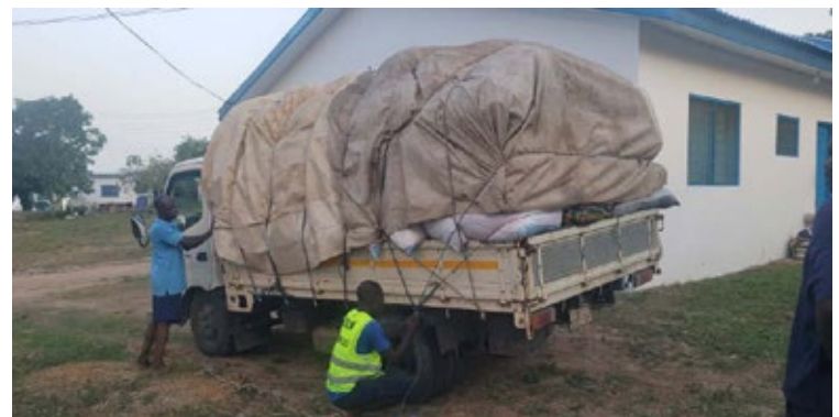
A fully-loaded truck about to depart to distribute used clothing and footwear in the Eastern and Northern Regions of Ghana