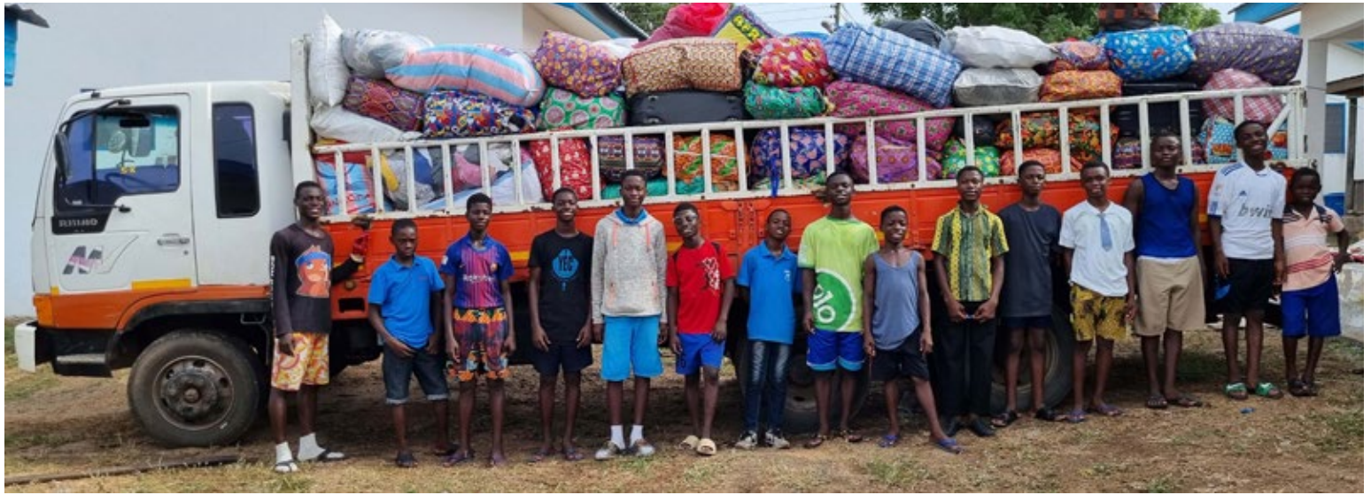
The children who loaded this truck pose for a picture before the fully-loaded truck departs to distribute their gifts in the Upper West Region of Ghana.

A long time ago, Jesus Christ told his disciples to “heal the sick, cleanse the lepers, raise the dead, cast out demons; freely you have received, freely give.” (Matthew 10:8) The mission of Village of Hope to save lives and serve humanity falls directly in line with Jesus’ instructions. As followers of Jesus today, we heal the sick through the work of the hospital. Those under the dominion of Satan are set free from the bondage of the devil and those who are dead in sin receive new life when they obey the gospel of Christ and are raised from the dead to walk in newness of life (Romans 6:1-4).