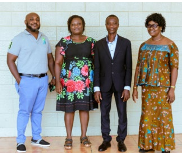
Members of the Hope Ridge School Board