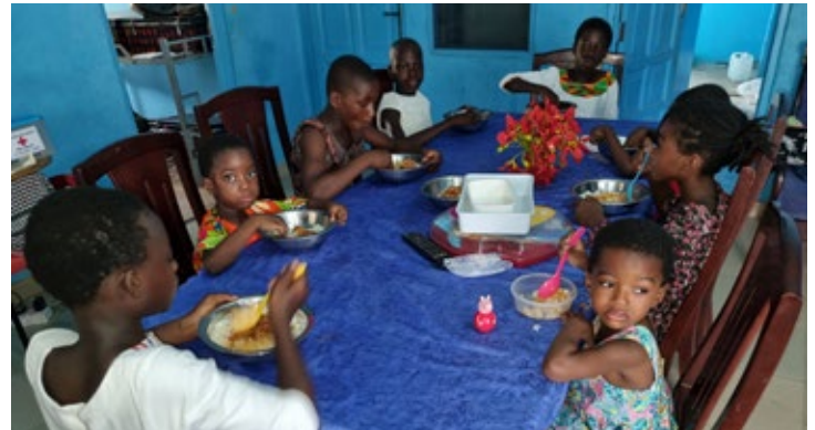
Meal time at Hope Children's Place