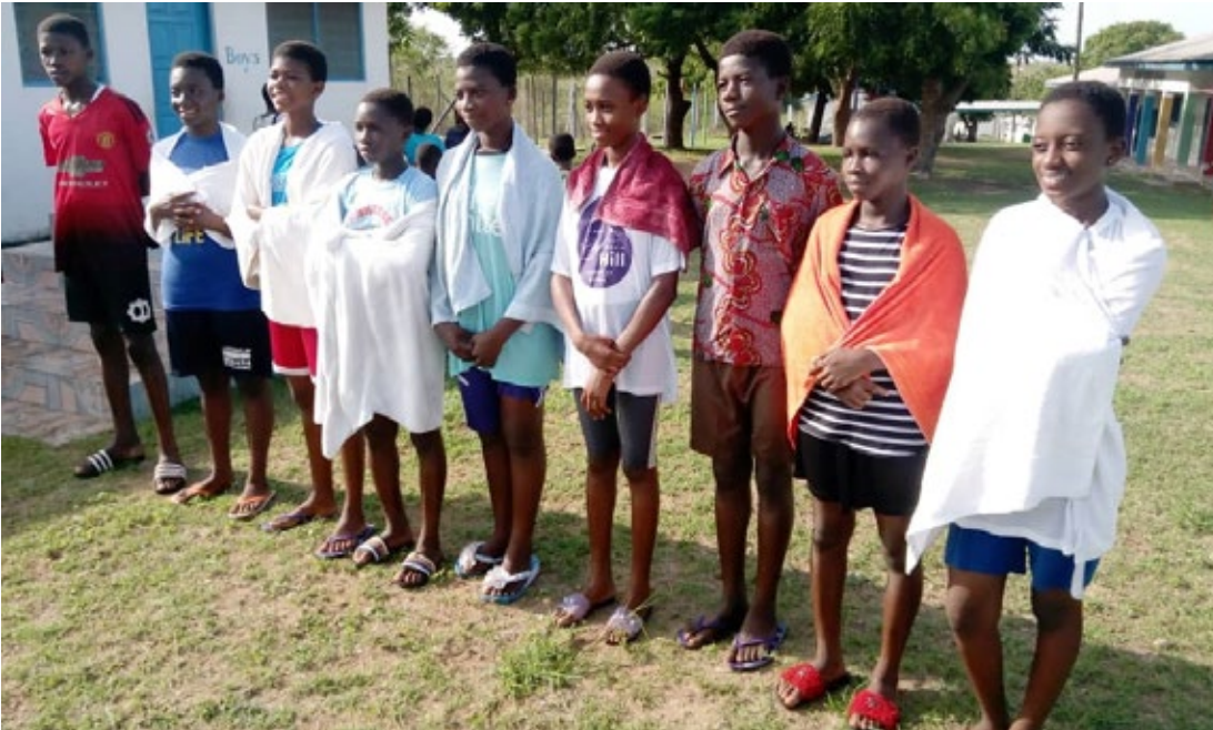
Some of those who were clothed with Christ through baptism at the church of Christ at Village of Hope

As angels rejoice over the conversion of one soul, we believe that there has been great rejoicing in heaven as 50 souls have been clothed with Christ through baptism at the church of Christ at the Village of Hope over the past three years. Out of the 50 souls saved, 9 were baptized in 2020, 10 in 2021, and 31 in the first five months of 2022.