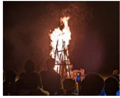
Bonfire on eve of anniversary