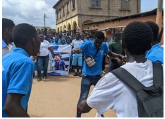
Students and staff of Hope Christian Academy during the float