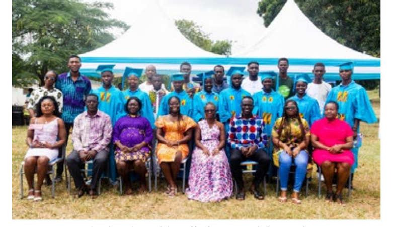
Graduating class with staff of Hope Training Institute