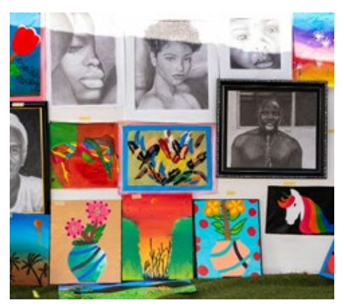
Exhibition of some products made by Hope Training Institute's 2022 graduating class