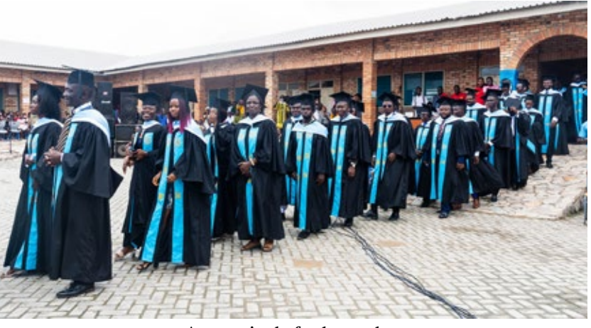
A procession by faculty members