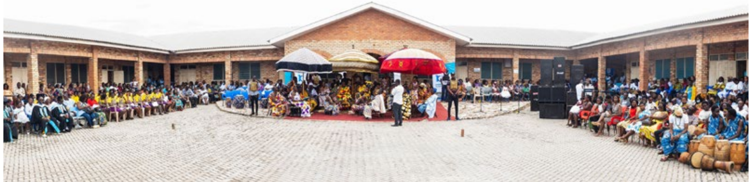
A cross section of the gathering during the 10th anniversary and 8th graduation ceremony at the Becky Holloway Courtyard