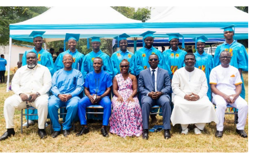
Graduating class with members of the Board of Directors of Hope Training Institute, Management of Village of Hope and invited guests.